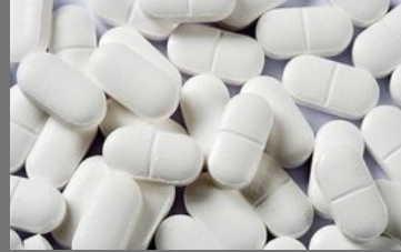
Citicoline 1000 mg