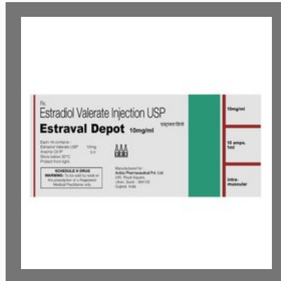
Estradiol Valrate Injection USP