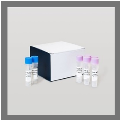
Plasmid DNA Extraction Kit