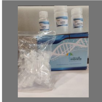
Plant DNA Extraction Kit