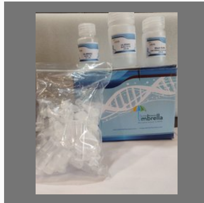
Insect DNA Extraction kit.