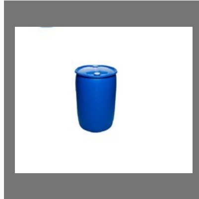
Chlorpyrifos 20% EC