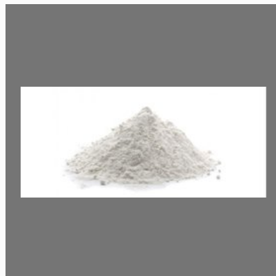
Sodium Methyl Paraben