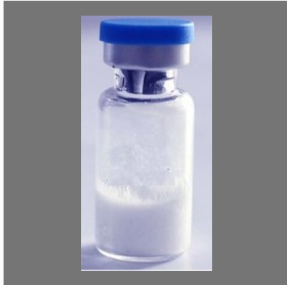
Lyophilized PCR Master Mix.