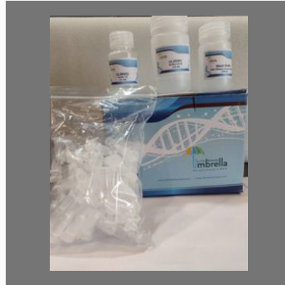
Tissue Direct Pcr