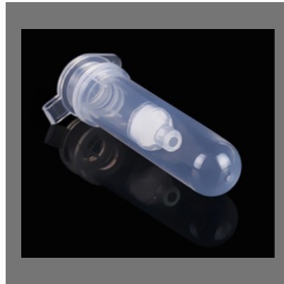
RNA SPIN COLUMN