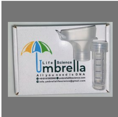
Noninvasive RNA Virus Saliva Collection Kit