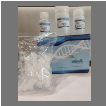
Viral RNA Isolation Kit