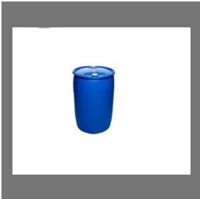
Fenvalrate 20 EC