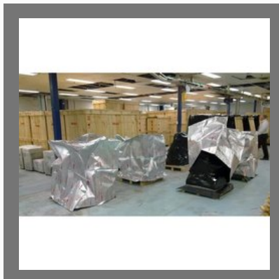
Sea Worthy Aluminum Foil Pouches