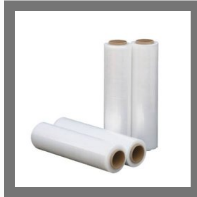
Strach Films Roll