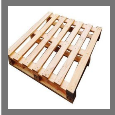
Wooden Packing Box