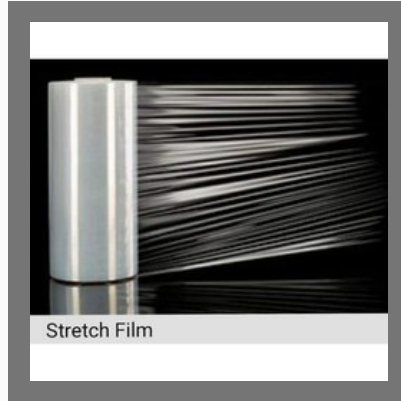
LLDPE Stretch Film Roll