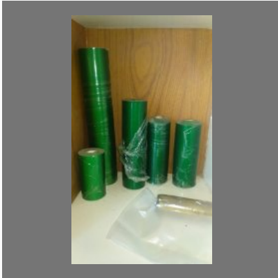
PVC Wrapping Film Roll