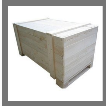
Industrial Pine Wood Packaging Box