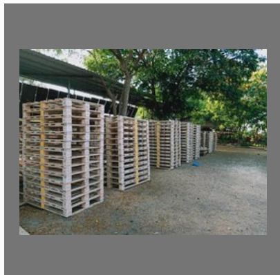
PHARMACEUTICAL PACKING WOODEN PALLET