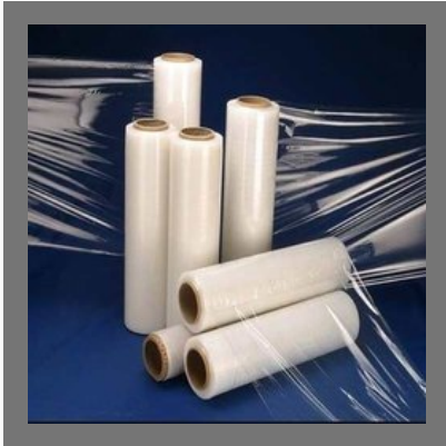
Plastic Stretch Wrapping Film Roll