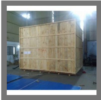
Industrial Wooden Packaging Boxes