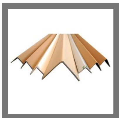
Paper Edge Protector