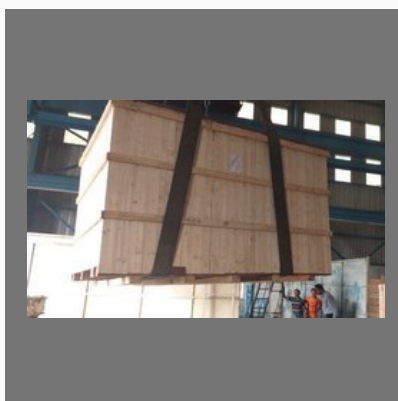
Domestic And Export Packing Wooden Box And Plywood Box