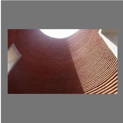
Oval During Construction