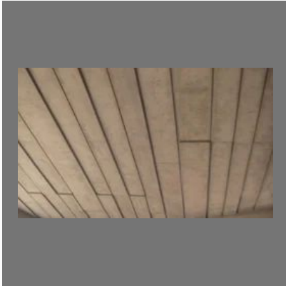
Residences Saket 2