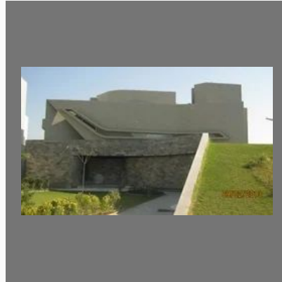
Balaji Green Valley Adalaj