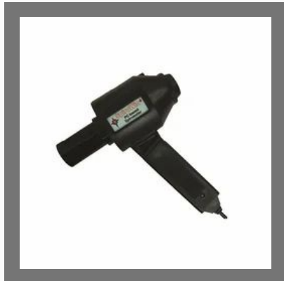
PC Based Pulmonary Function Analysis Systems