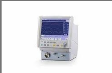
BPL Leoni Plus HFO Ventilator