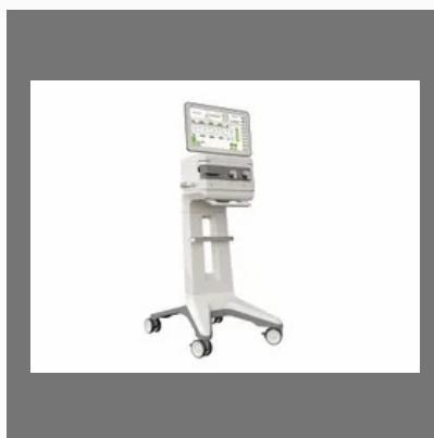
BPL Elisa 600 Ventilator