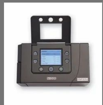
Nidek BiPAP Machines: DPAP Bi Level