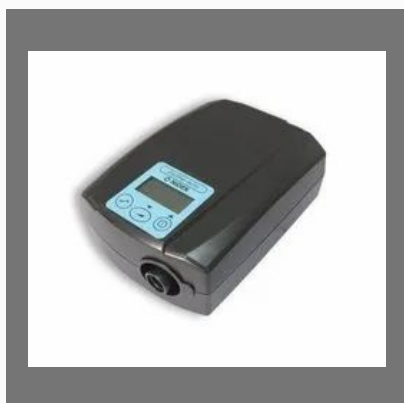
NIDEK CPAP Machine