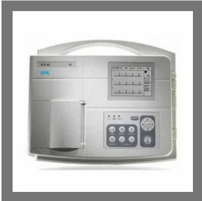
ECG Recorder Machines