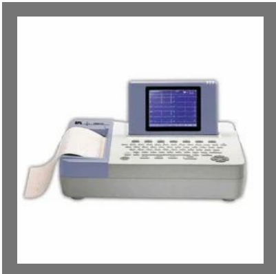
Multi Channel ECG Recorder Machines