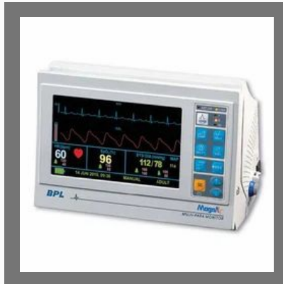
Multi Parameter Patient Monitoring