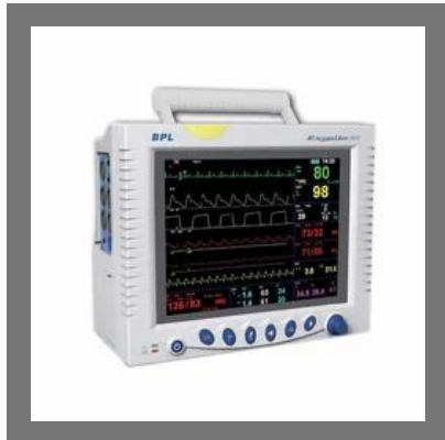
Multi Parameter Patient Monitoring