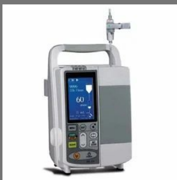
Infusion Volumetric Pumps