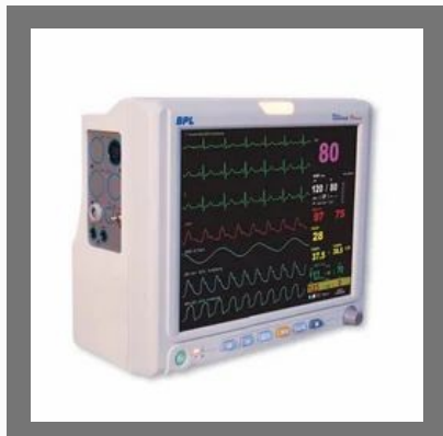
Multi Parameter Patient Monitoring