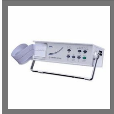
ECG Recorder Machines