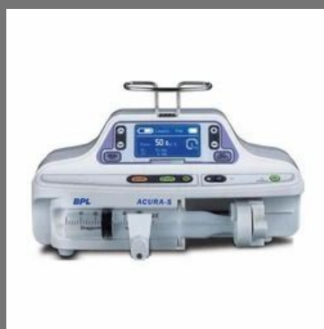
Infusion Syringe Pumps