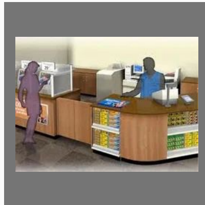
Product Tests Service