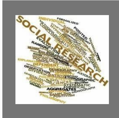
Social Studies Research Service