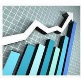
Consumer Research Service