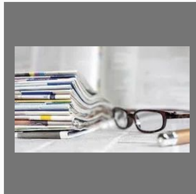
Corporate Studies Research Service