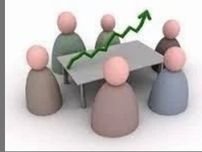
Industrial Research Service