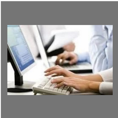
Online Interview Service