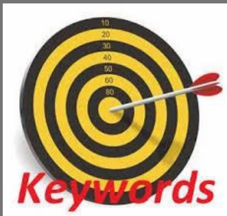
Media Research Service