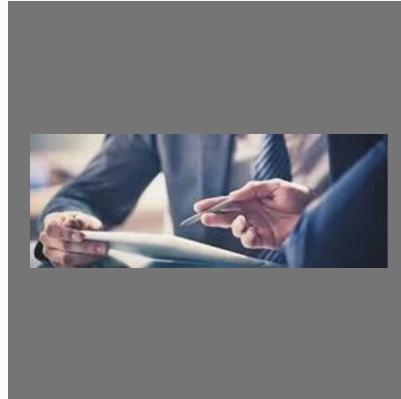
In - Depth Interviews Service (DI)