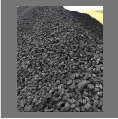
Low Ash Met Coke In Visakhapatnam