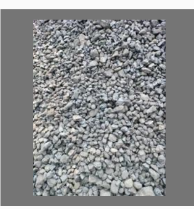
5200 Gar Indonesian High GCV Screened Coal