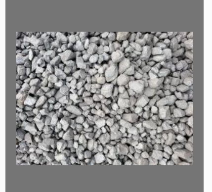
Russian Pci Coal