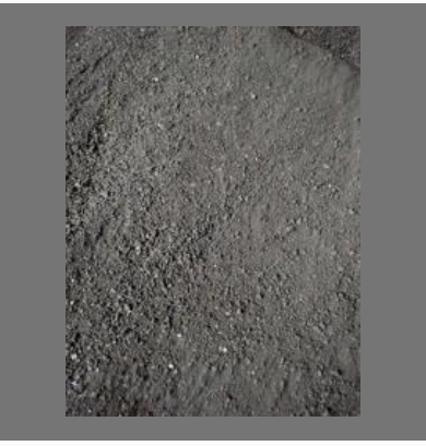
Rb2 South African Coal FINES