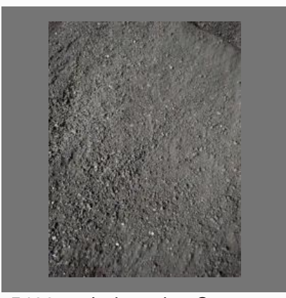
5400gar Indonesian Steam Coal