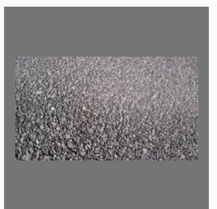
4800 Nar South African Coal Lumps