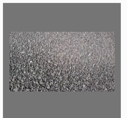
3400 Gar Indonesian steam coal chips 8 to 20 MM