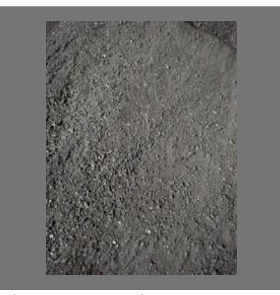
South African Coal Rb2 Screened Coal 8 to 50 mm 5500 Nar