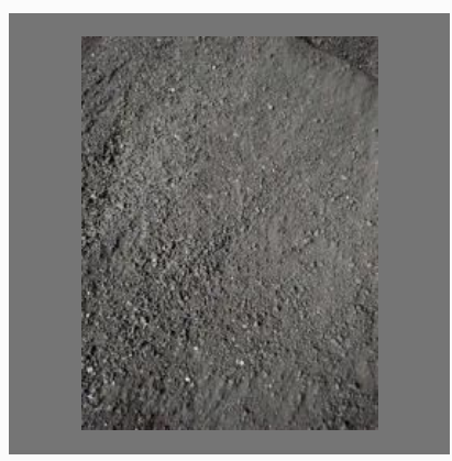
South african RB3 coal fines