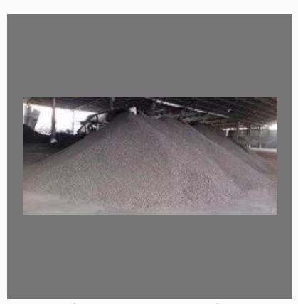
5300 Gar Indonesian Steam Coal Chips 8 To 20