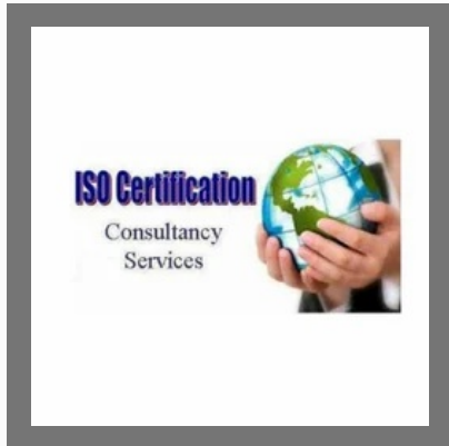
Iso 9001 Certification