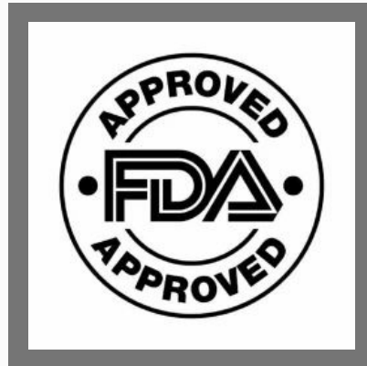
US FDA Foreign Supplier Verification Program (FSVP)