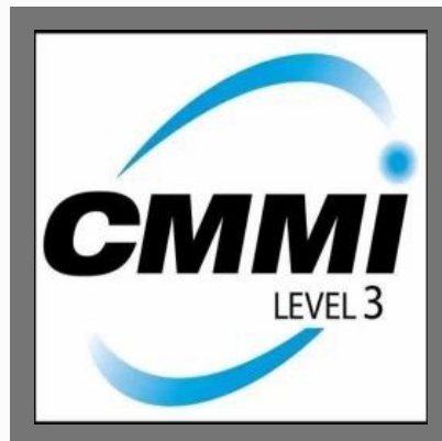
CMMI Level 3 Certification Services