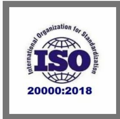
ISO 20000 ITSM Certification Services