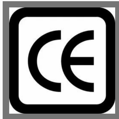
European CE Mark Certification