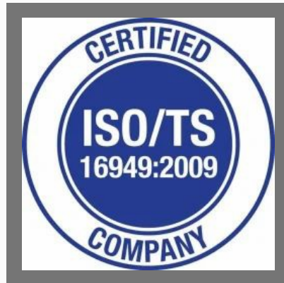
ISO TS 16949 Certification