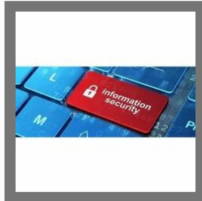
Isoiec 27001 2013 Certification