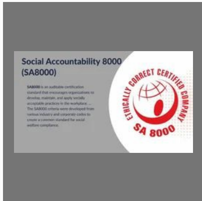
SA 8000 Certification Services