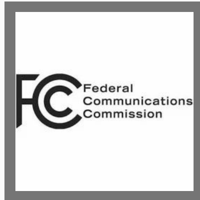
FCC Certification Services