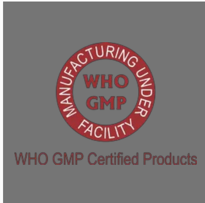
Who GMP Certification Company