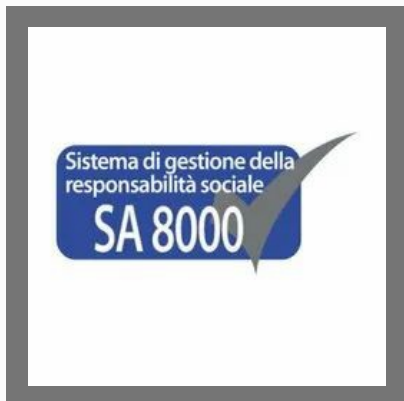
SA8000 Certification Services