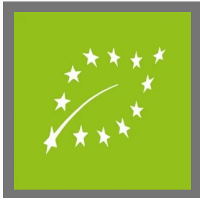
EU Organic Certification