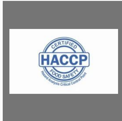
HACCP Certification Cost in India