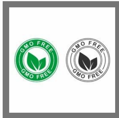
Non GMO Certification Services