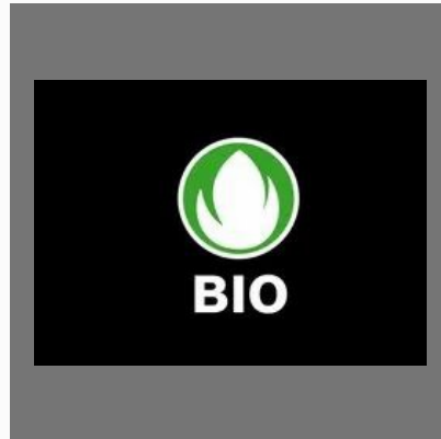
Bio Suisse organic Certification