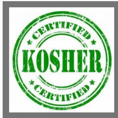
Kosher Certification Services