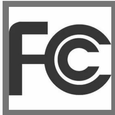
Fcc Certification Services