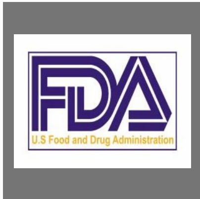
US FDA Registration