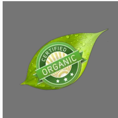
Usda Organic Certificate