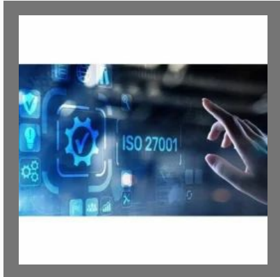
ISMS Certification Services in India