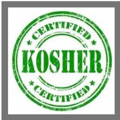
Kosher Certificate Services