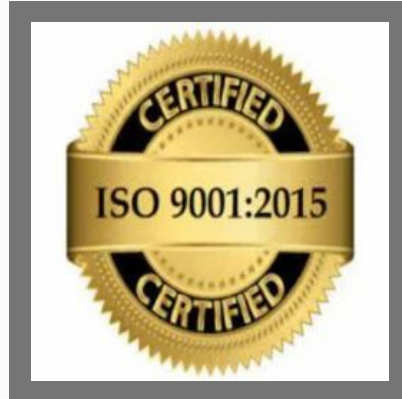
ISO 9001 Certification