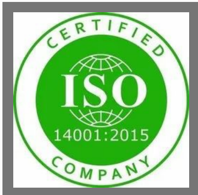
Best ISO 14001 Certification