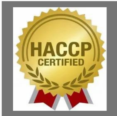
HACCP Certification Service