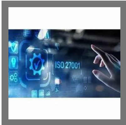
ISO 27001 Certification