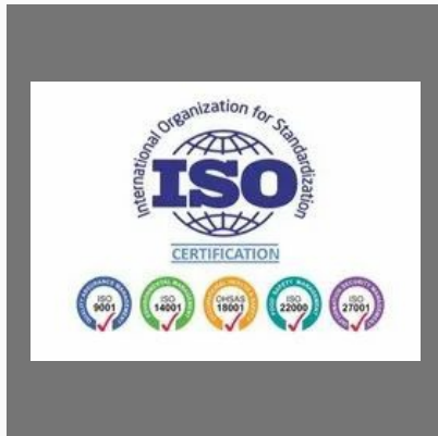
ISO Certification Agency