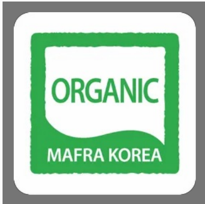
KOR Organic Certification