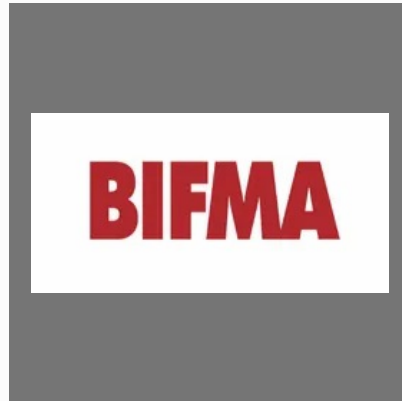
BIFMA Certification Level 3