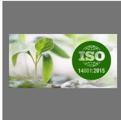
ISO 14001:2015 Certification