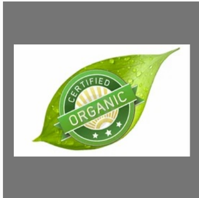
NOP USDA Organic Certification Consultant