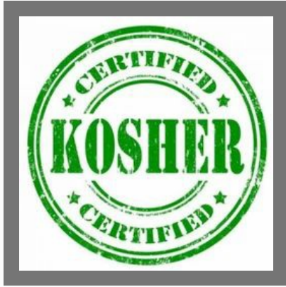
Kosher Certification Services