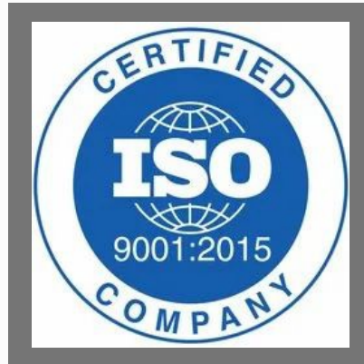
ISO 9001 2015 Certification Services