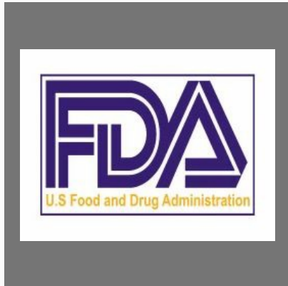
Us Fda Registration India