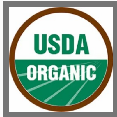
Usda Organic Certification Service