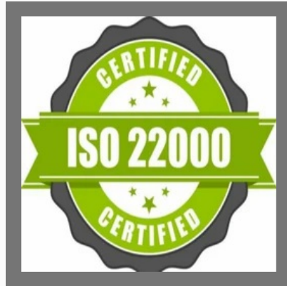
ISO 22000:2015 Certification