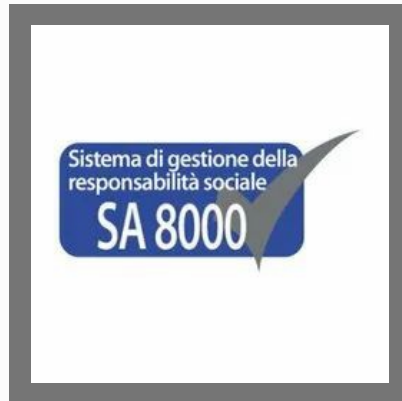
SA 8000 Certification in India