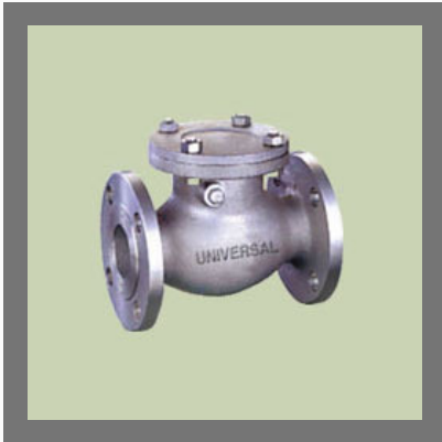
C.S. Swing Check Valve Flanged