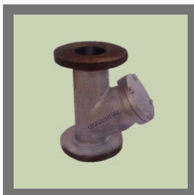
C.I. Strainer Special Valve