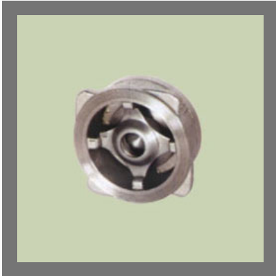
Disc Check Type Non Return Valve