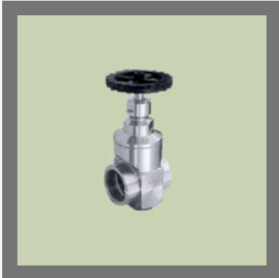
S.S. Gate Valve Screwed End Gate Valve