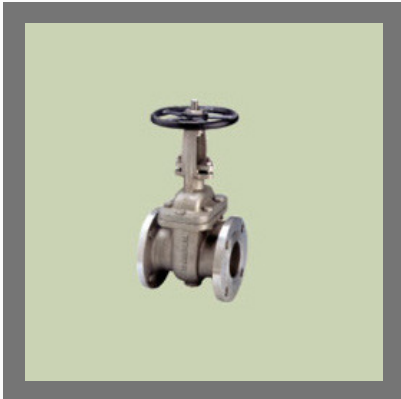
C.S. Gate Valve Flanged Type Gate Valve