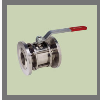
S.S. Three Piece Flanged End Ball Valve