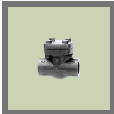
Forged Carbon Steel Gate Valve