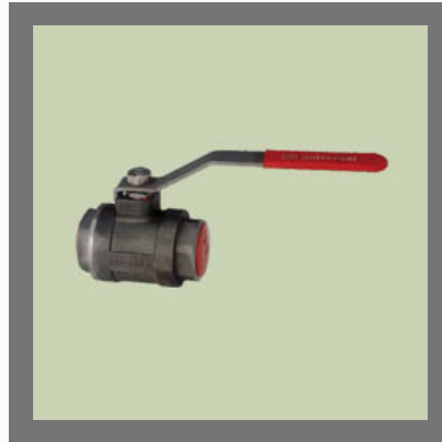
I.C. Single Piece Screwed End Ball Valve