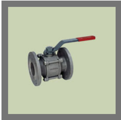
I.C. Three Piece Flanged End Ball Valve