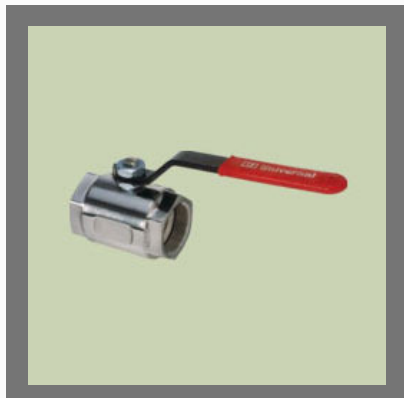
S.S. Heavy Type Screwed End Ball Valve