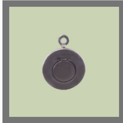
Water Check Valve