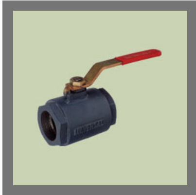
C.I. Single Piece Screwed End Heavy Ball Valve