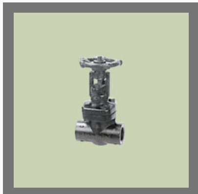
Forged Carbon Steel Globe Valve