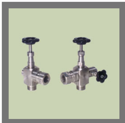
SS Gauge Glass Cock Screwed End Valve