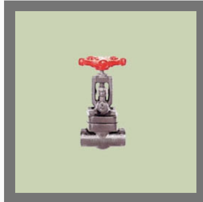
Forged Carbon Steel Gate Valve