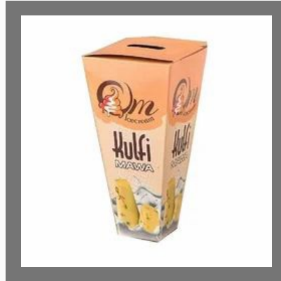
Printed Duplex Box