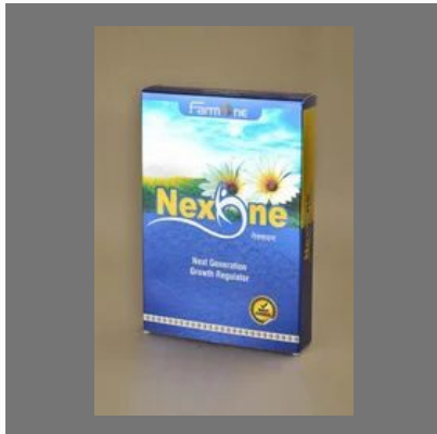
Printed Metallic Box