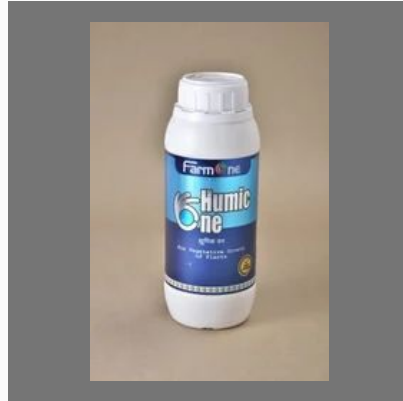
Printed Metallic Stickers