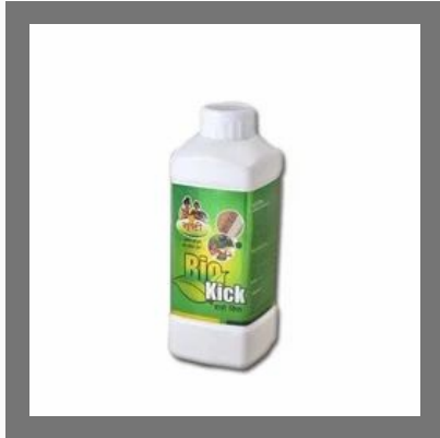
Printed Adhesive Label Stickers