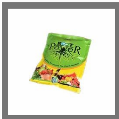
Printed PP Pouch