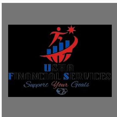
Financial Planning Services