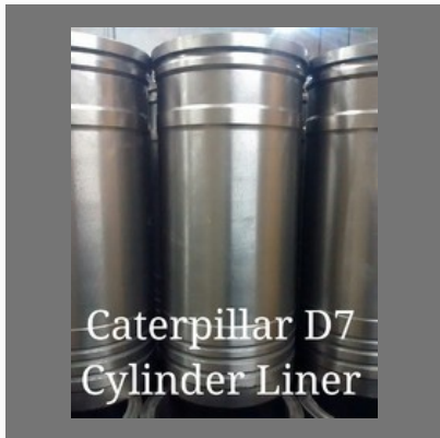
Caterpillar D7 Cylinder Liner