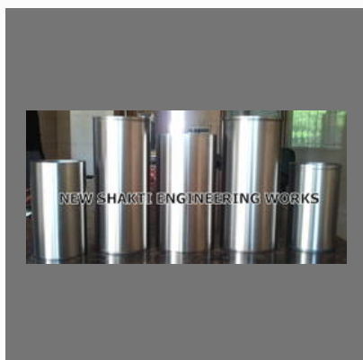
Toyota Cylinder Liner