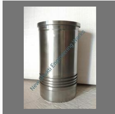
Kirloskar Bliss Cylinder Liner