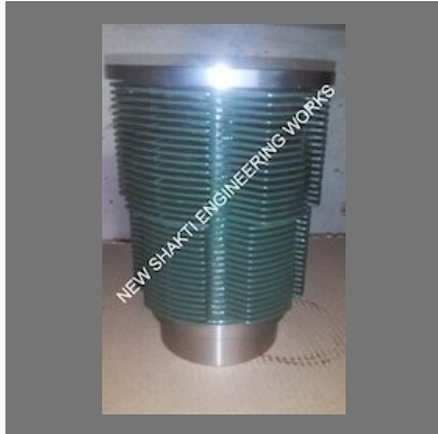
Kirloskar EA10. EA16 Cylinder Block