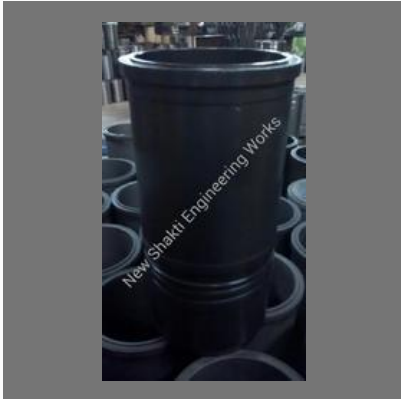
Cummins NH Cylinder Liner