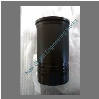
Komatsu 6D125/S6D125 Cylinder Liner