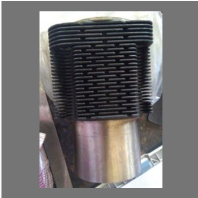
Deutz 511 Cylinder Block