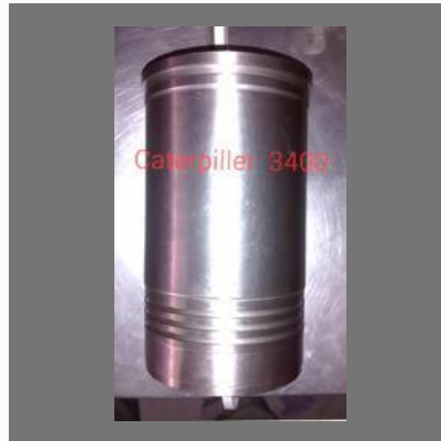
Caterpillar 3400 Cylinder Liner