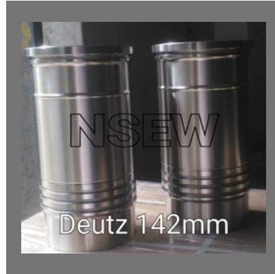
DEUTZ BA 6M 816 CYLINDER LINER