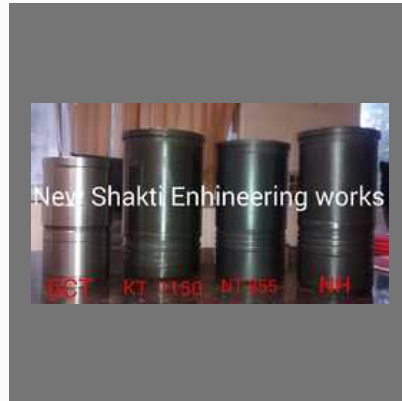
Cummins Series Cylinder Liner