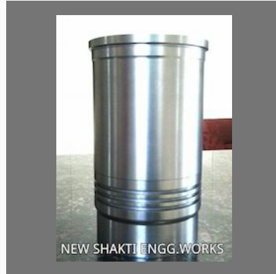
Kirloskar 4R (1040) Cylinder Liner