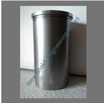
Kirloskar 6SL90 Cylinder Liner