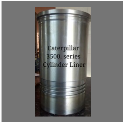
Cat 3500 Engine Cylinder Liner