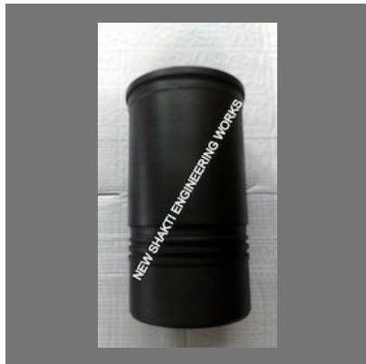
Cummins Nt855 Cylinder Liner