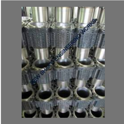
Deutz FL912 N.V Cylinder Block