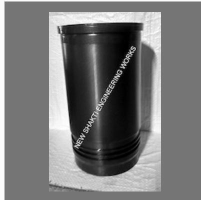
Komatsu 6D105 Cylinder Liner