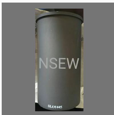
Mazda SL Engine Cylinder Liner