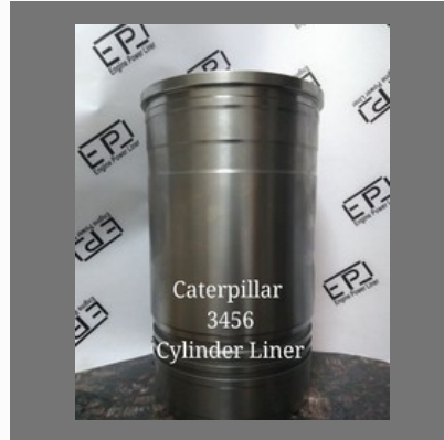
Caterpillar 3456 Cylinder Liner