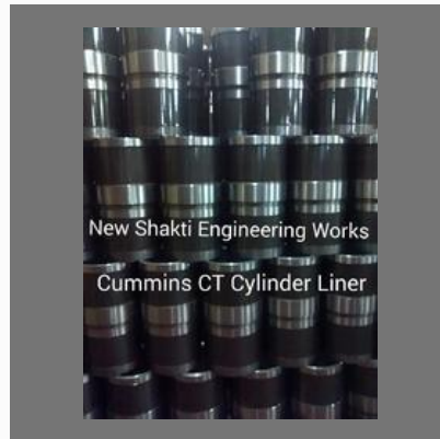
Cummins CT Cylinder Liner