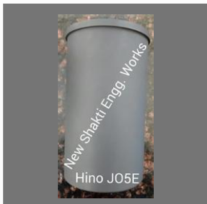
Hino JO8E / JO8EA / JO8CE Cylinder Liner