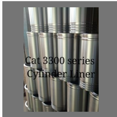
Caterpillar 3306 Cylinder Liner