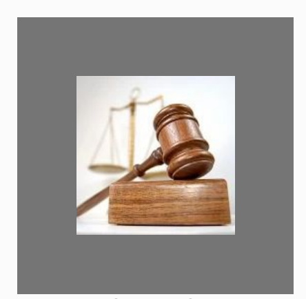
Litigation Support Services