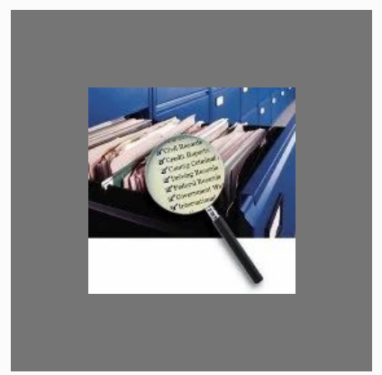
Background Screening Services