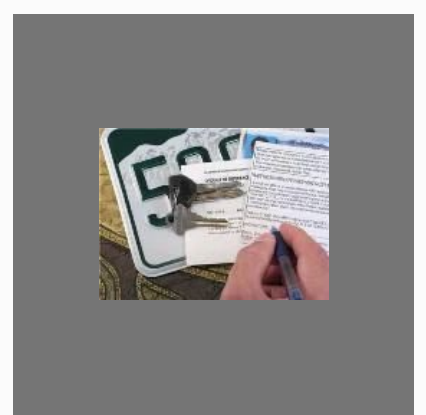
Verification Of Insurance Claims Services