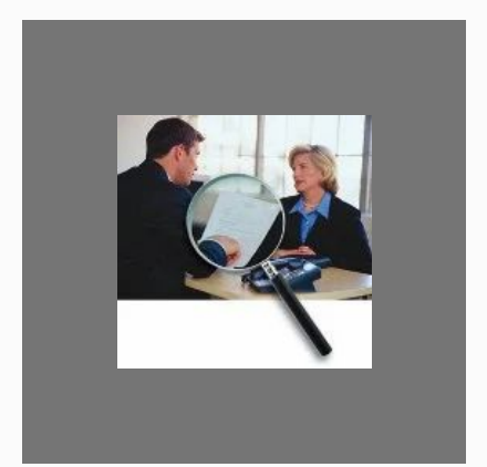
Pre Post Employment Verification Services