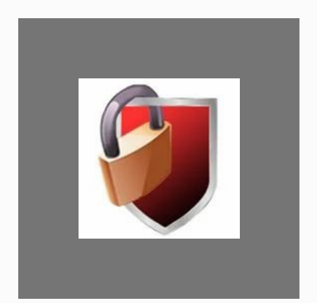
Security Audit Services