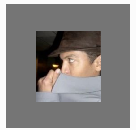
Undercover Agent Services