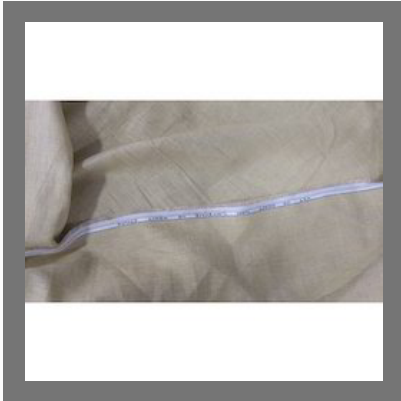
Siyarams Royale Linen Fabric