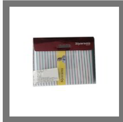
Siyarams Shirt Fabric Gift Set