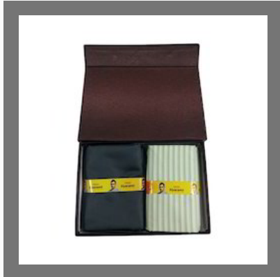
Siyaram Unstitched Pant Shirt Fabric Gift Set