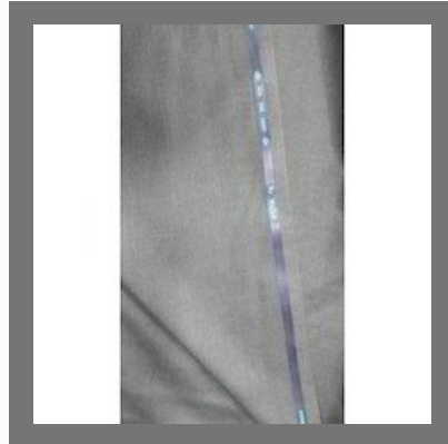
Mistair Suit Fabric