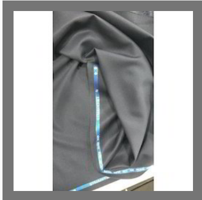
J Hampstead Grey Suit Fabric