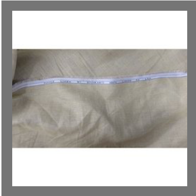
Cotton Linen Fabric