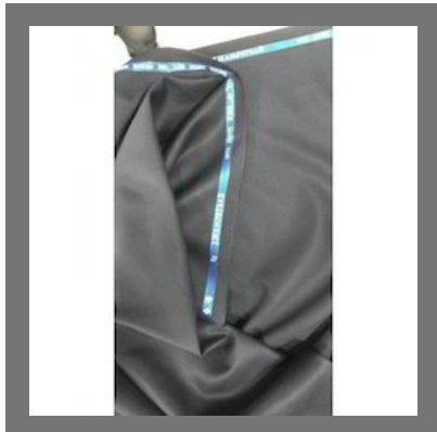
J Hampstead Suit Fabric