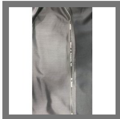
Siyarams Suit Fabric