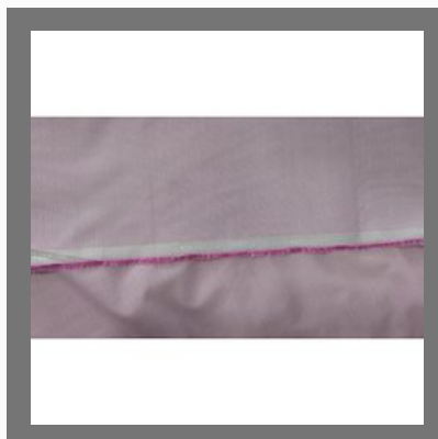
Siyarams Shirting Fabrics