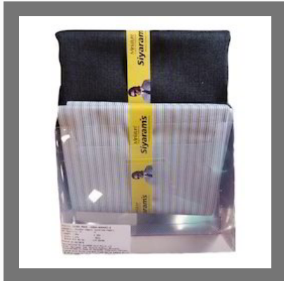
Unstitched Pant Shirt Fabric Gift Set