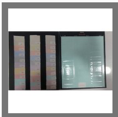
Siyarams Corporate Uniform Fabric