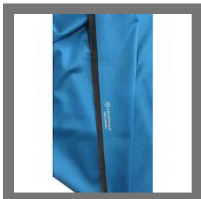
J Hampstead Shirt Fabric