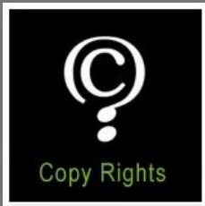
Copy Rights & Trade marks