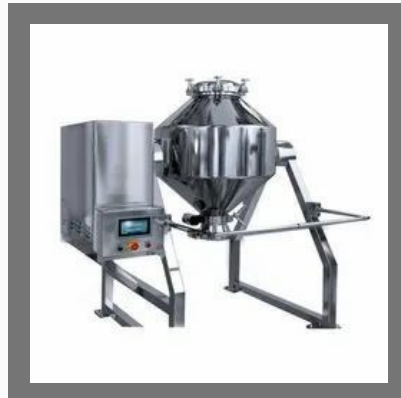
Double Cone Blender