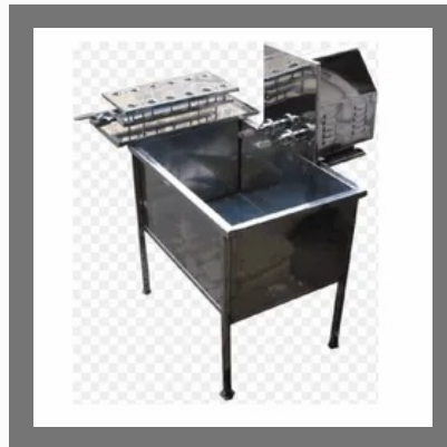
Semi Automatic Bottle Washing Machine