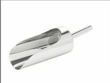
Stainless Steel Scoop