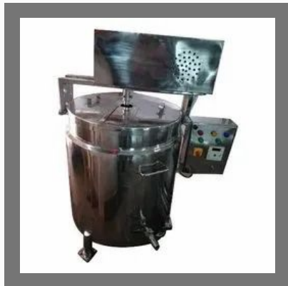
Jacketed Stainless Steel Tank