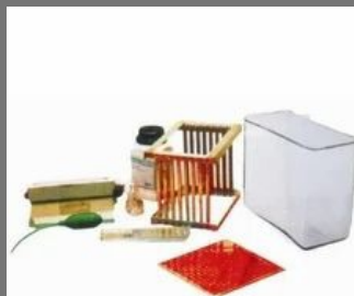
Thin Layer Chromatography Kit (TLC Kit)