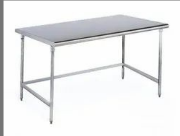
Stainless Steel Table