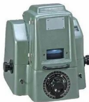
IR Moisture Balance