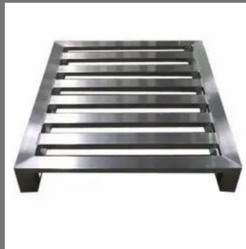
Stainless Steel Pallet