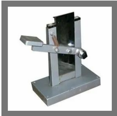
Aluminum Tube Crimping Machine