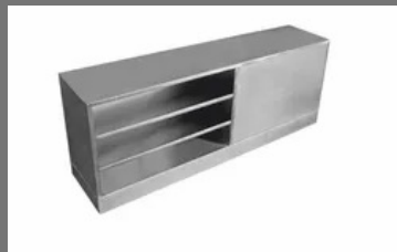
Cross Over Bench & Shoe Rack