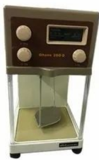
Single Pan Balance