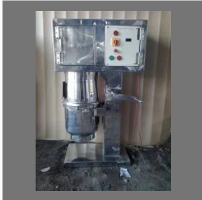
Planetary & Ointment Mixer