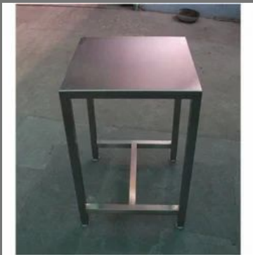
Stainless Steel Stool