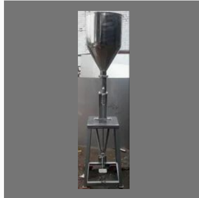
Foot Operated Liquid & Ointment Filling Machine