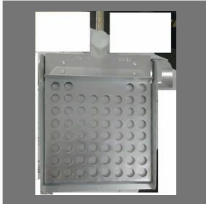
Tablet Capsule Counter (Manual)