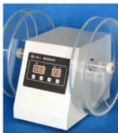
Friability Test Apparatus