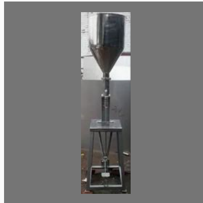
Foot Operated Liquid & Ointment Filling Machine