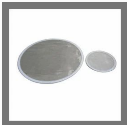
Shifter Sieve Silicon Moulded