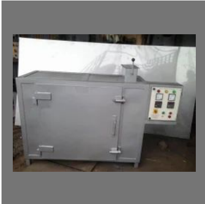
Hot Air Dryer