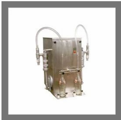
Semi Automatic Liquid Filling Machines