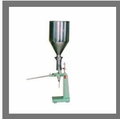
Hand Operated Paste Cream Tube Filling Machine