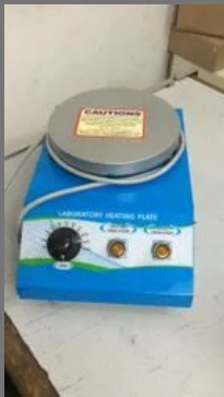
Laboratory Hot Plate