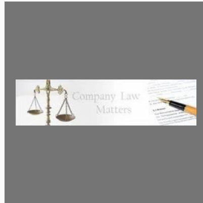
Corporate Law Matters