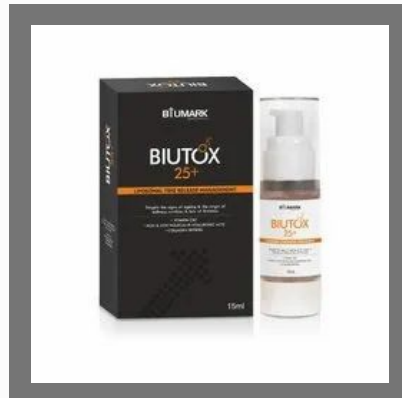
Biumark Biutox 25% Vitamin C Serum