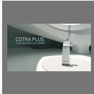
Cotra Plus (US FDA) Fractional Co2 Laser