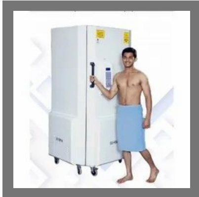
UVEC Series Whole Body UV Therapy