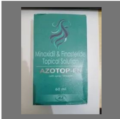
Minoxidil & Finasteride Topical Solution