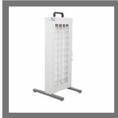
Mini Home Therapy