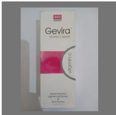
Gevira Vitamin C Serum