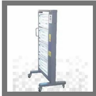
Multi Purpose Localized Machine