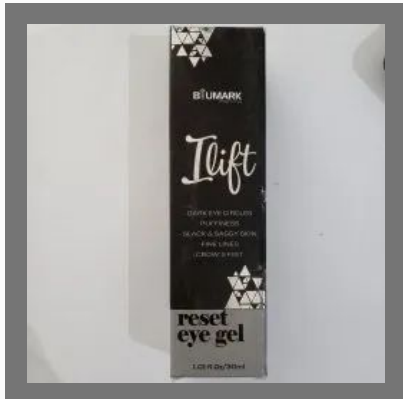
Biumark I Lift (Under Eye And Fine Lines Gel Serum)