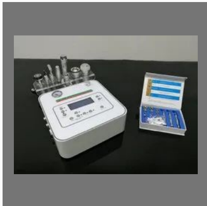
Electroporation ,microdermabrasion With Rf Tightening