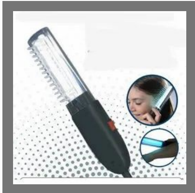
UV - 311 Laser Comb