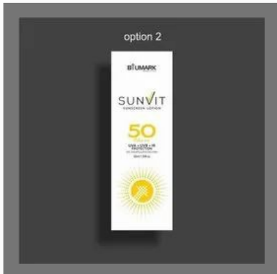
Biumark Sunvit (Sunscreen 50 PA Protection Cream)