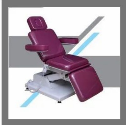
Derma Chair (Three Actuator Cosmetic Procedure Chair )