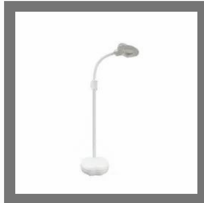
LED Magnavision Light