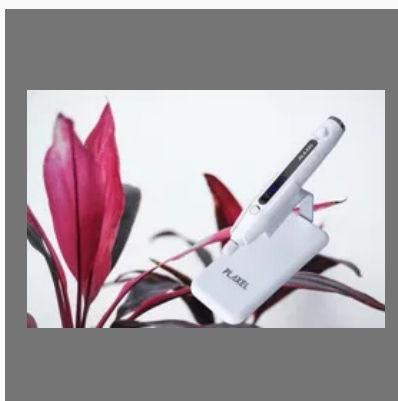
PLAXEL PLASMA PEN (KOREA)