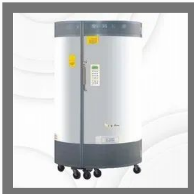
Whole Body UV Therapy System