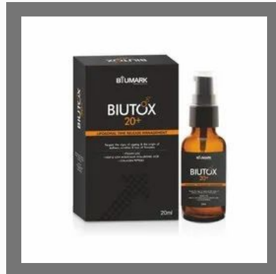
Biumark Biutox 20% Vitamin C Serum