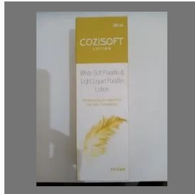
Body Moisturizing Lotion