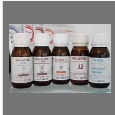
Sesderma Chemical Peels