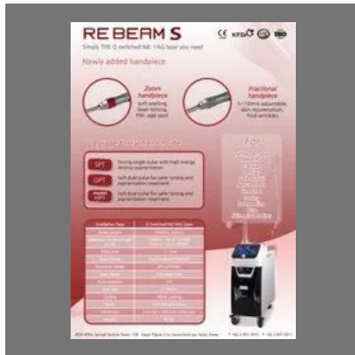
Re Beam (us Fda) Q Switch Nd Yag Laser