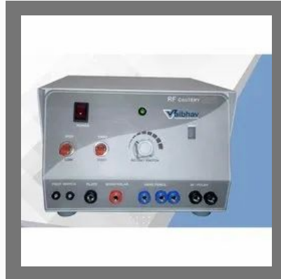
RF Cautery 3 MHz