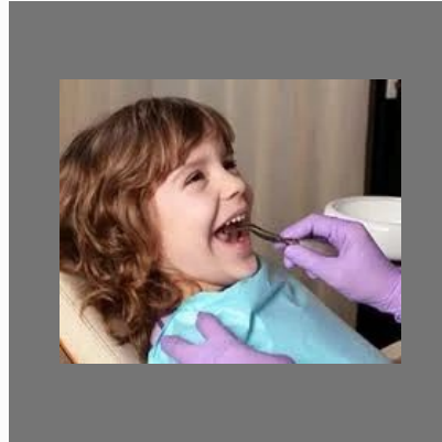
Dental Preventive Care For Children