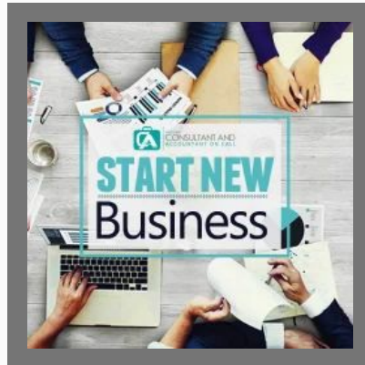
Private Limited Company Registration Service