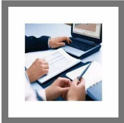
Company Registration Consultant