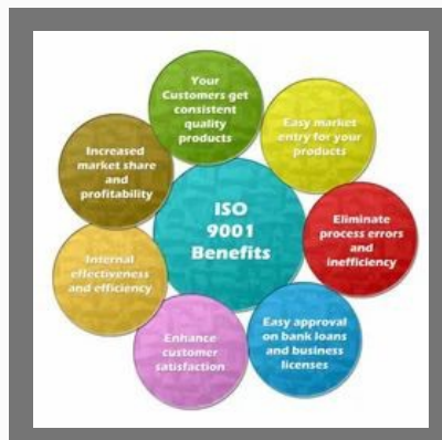
ISO Certification Services