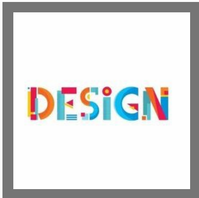
Design Registration Service