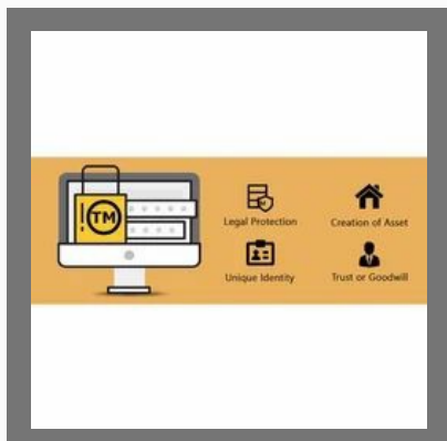
Trademark Assignments Service