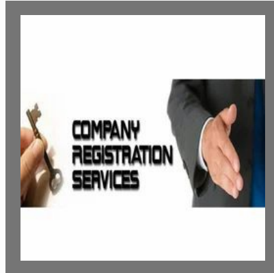
New Company Registration Consultant Services