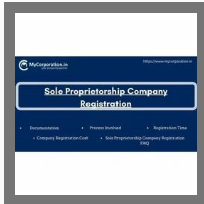
Sole Proprietorship Registration Service