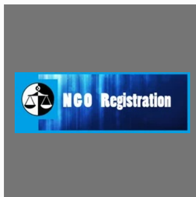
NGO Registration Services