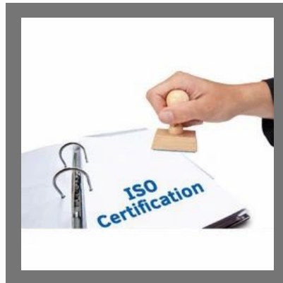
ISO Certification Consultancy Services