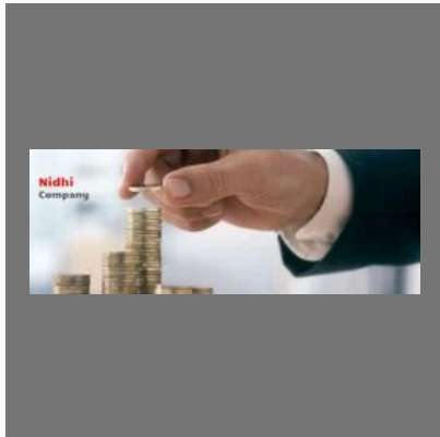
Nidhi Company Registration