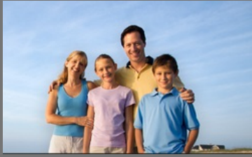
Personal Insurance Service