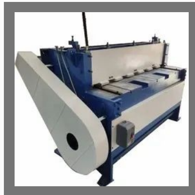
Mechanical Under Crank Shearing Machine