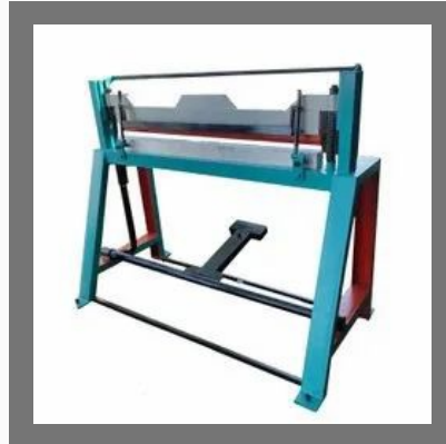
Foot Operated Metal Sheet Bending Machine