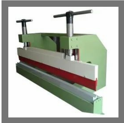
Screw Press Metal Sheet Bending Machine