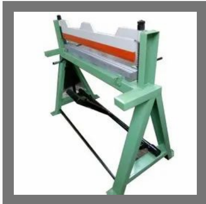
Manual Sheet Metal Bending Machine