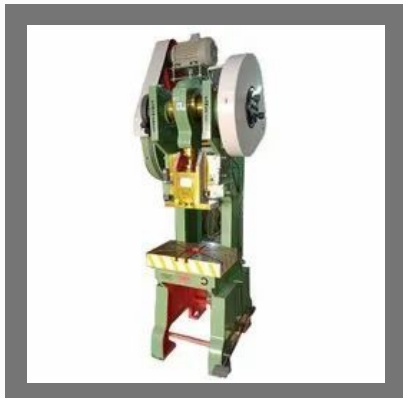
30 Ton C Frame Power Press Machine