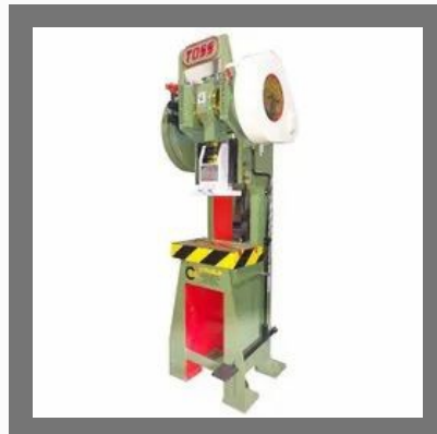
3 Ton C Frame Power Press Machine