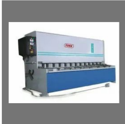
Hydraulic Metal Sheet Shearing Machine