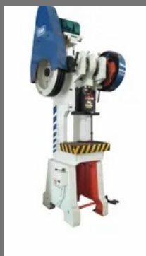
Semi Automatic C Type Power Press Machine