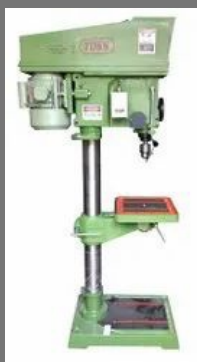
25mm Heavy Duty Pillar Drill Machine