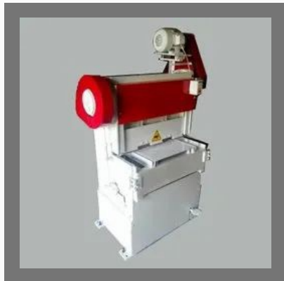
Automatic Mechanical Over Crank Shearing Machine