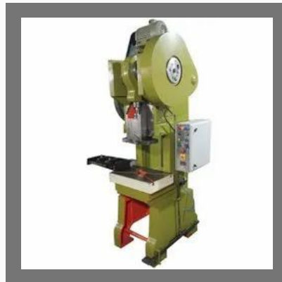
Auto Feeder Sensor Mechanical Power Press