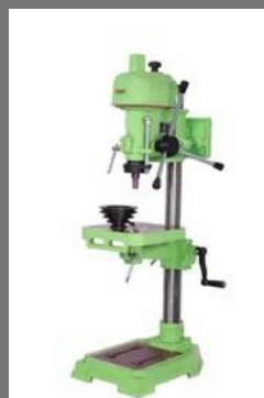
Pillar Drilling Machine