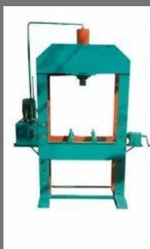
15 Ton H Type Hydraulic Press Machine