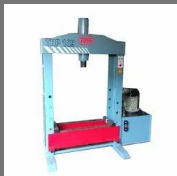
H Frame Hydraulic Machine