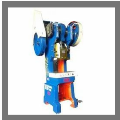
Toss 30 Ton Mechanical Power Press Machine