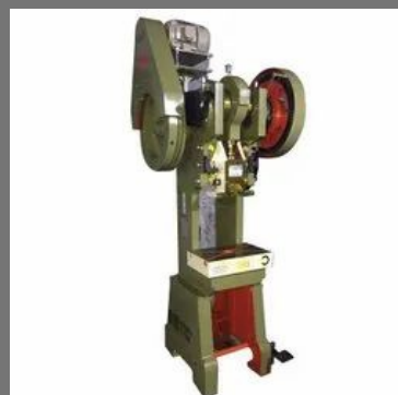
Mechanical C Type Power Press Machine