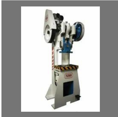
10 Ton C Type Power Press Machine