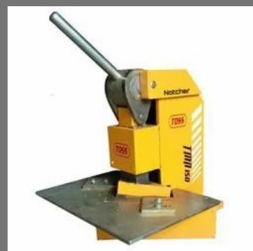
Toss Hand Operated Notching Machine