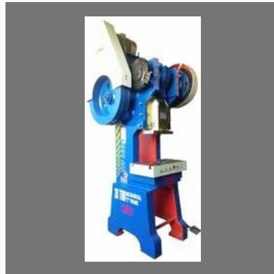
20 Ton Mechanical Power Press Machine