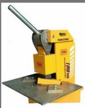
Hand Notching Machine