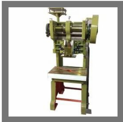
10 Ton Mechanical SPM Power Press