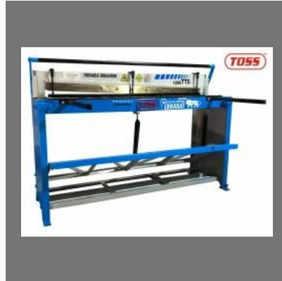
Treadle Guillotine Shearing Machine