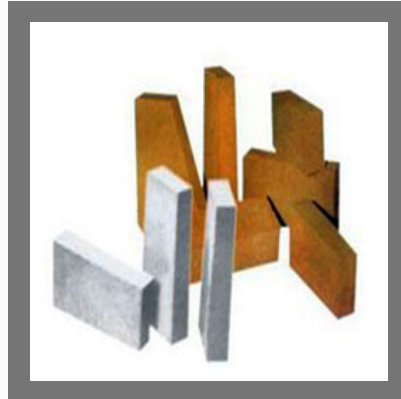
Basic Fire Bricks