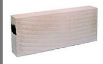
Calcium Silicate Insulation Blocks