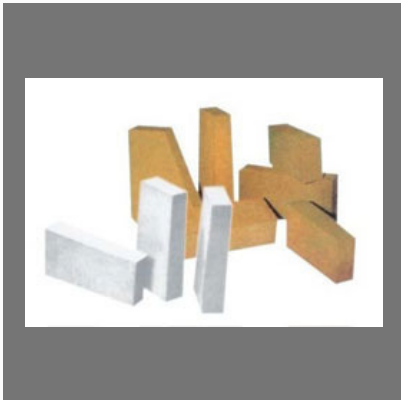
High Alumina Bricks