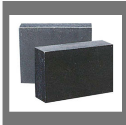
Magnesia Carbon Bricks