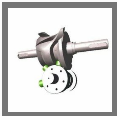
Globoidal Cam Index