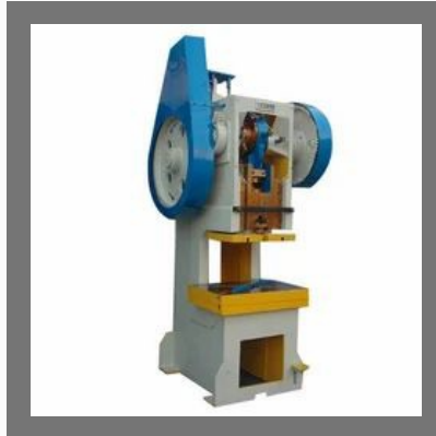
H Frame Press Machine