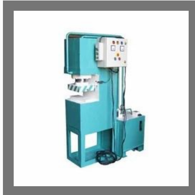
Hydraulic Special Purpose Machine