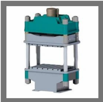
Pillar Press Machine