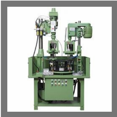
Automatic Special Purpose Machine