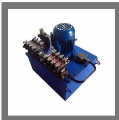
Hydraulic Power Pack