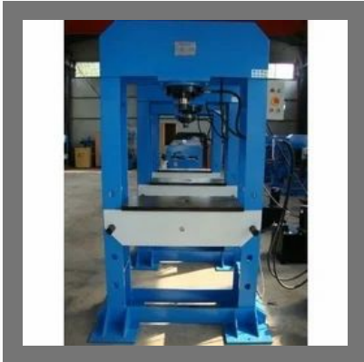
Hydraulic Press Machine