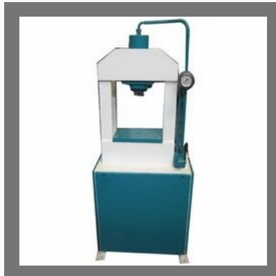
Fix Frame Press Machine