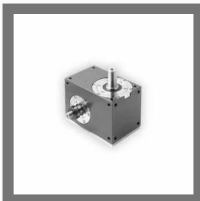
Cam Indexing Device