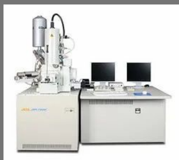
Scanning Electron Microscope