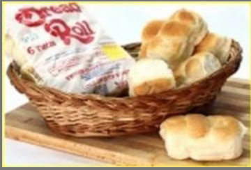
Secondary Ion Mass Spectrometer