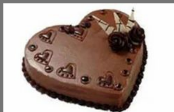
Gas Flow Meter