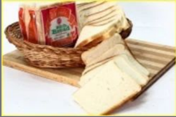
Organic Elemental Analyzer