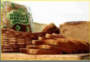
Pharma Electrical, Thermal & Mechanical Instrument