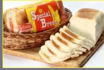
Auger Electron Spectrometer