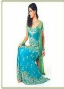
Embroidered Lehenga Choli