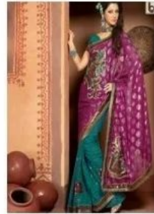
Shimmer Net Sarees