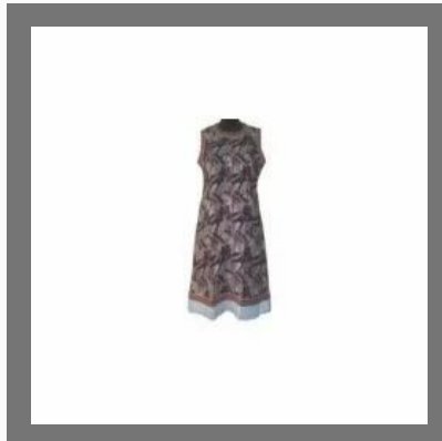
Screen Print Kurtis