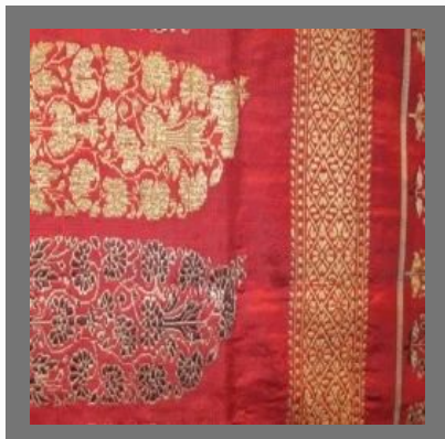
Zari Kota Sarees