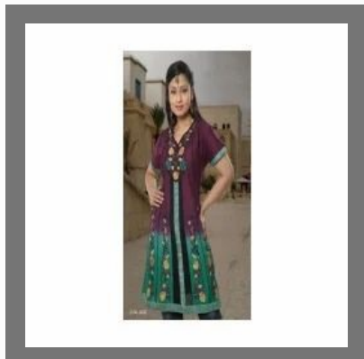
Indo Western Kurtis