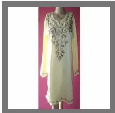
Kashmiri Work Kurtis