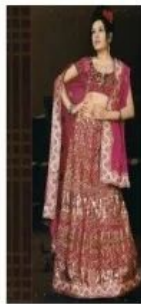
Bridal Lehenga Choli