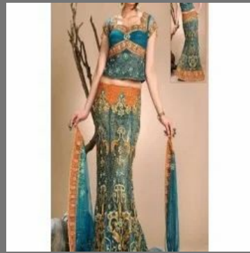
Designer Lehenga Choli