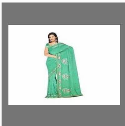
Kashmiri Work Sarees