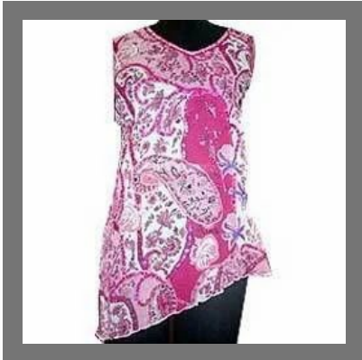
Short Designer Kurtis