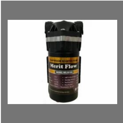
150 Gpd Ro Membrane