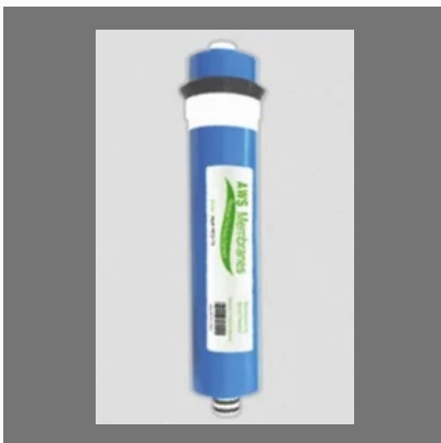
Membranes AWS 75 (For High TDS)