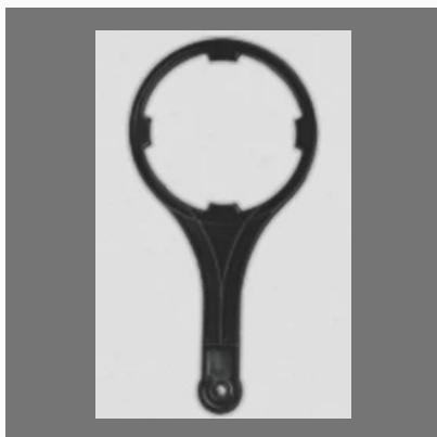
10 Inch Housing Spanner