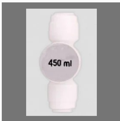
Flow Restrictor 450 ML