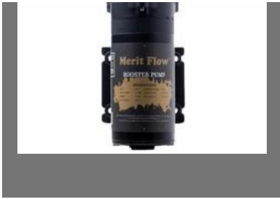
Eco 100 Gpd Water Pump