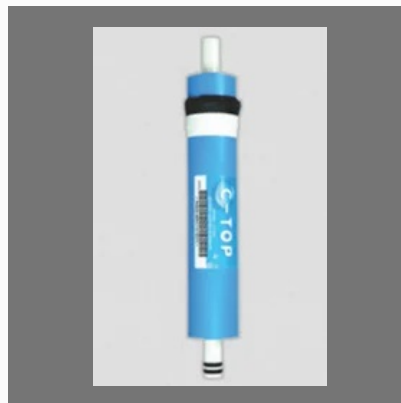
Membranes C Top 80