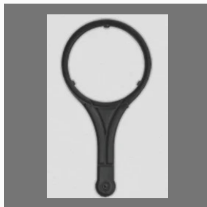
20 Inch Housing Spanner