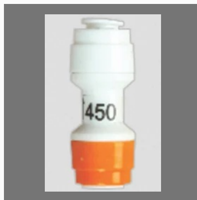
300, 450, 550, 600, 800 ml (2 Inch) Flow Restrictor