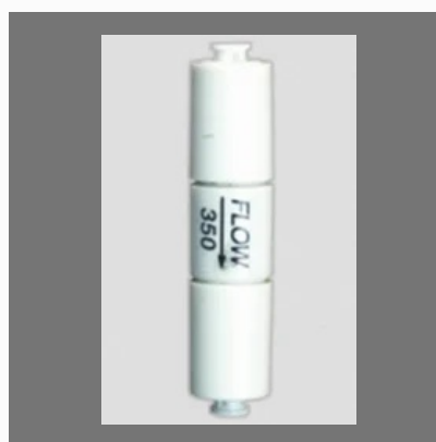
350, 450, 550 MI (Shitong) Flow Restrictor