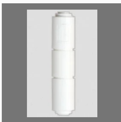
350, 450, 550 MI (JFC) Flow Restrictor