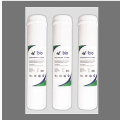
Inline Filters Bio (Thread)