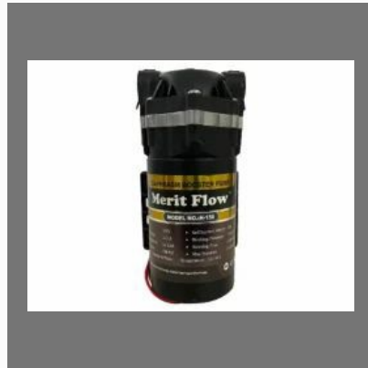
Ro Booster Pump 100 Gpd