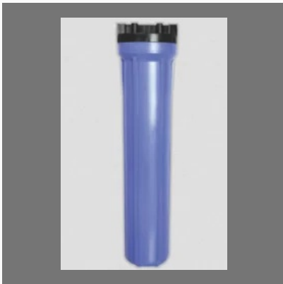
20 Inch Slim Filter Housing