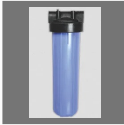
20 Inch Big Blue Filter Housing