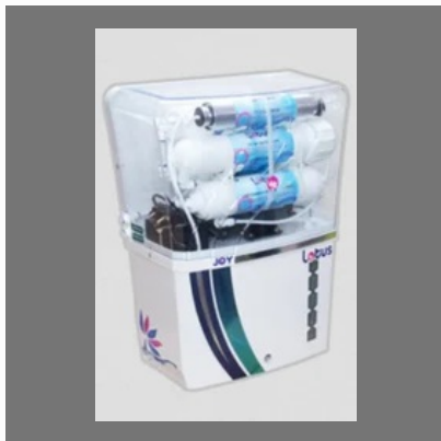
Lotus Apple RO UV