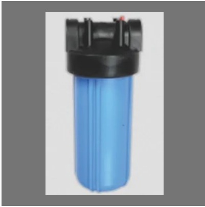
10 Inch Big Blue Filter Housing