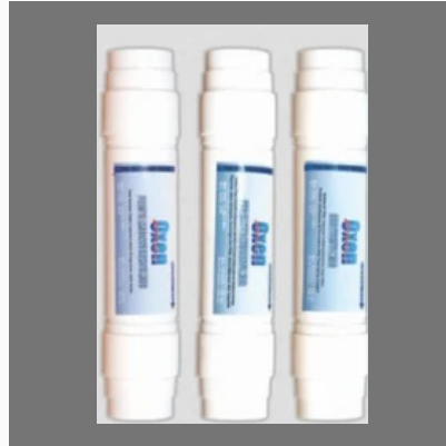
Inline Filters Oxen (Push Fit)