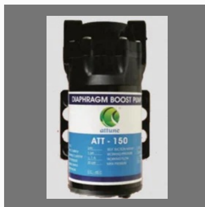
Diaphragm Boost Pump ATT