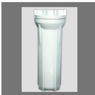
10 Inch Filter Housing