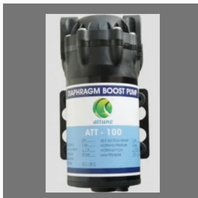
Diaphragm Boost Pump ATT- 100