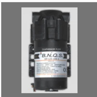
BNQS 100 GPD Pump