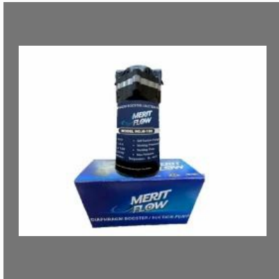
Ro pump 100GPD