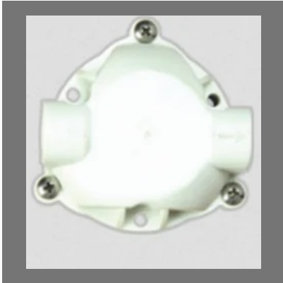
Techno Pump Head