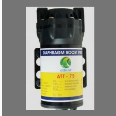
Diaphragm Boost Pump ATT-75