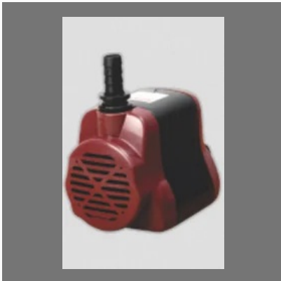
Black And Maroon Bucket Pump