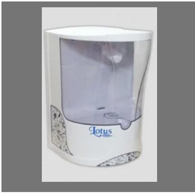
Lotus Dolphine Naturel RO