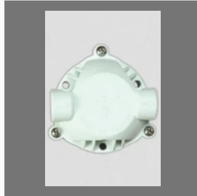
Kemflow Pump Head