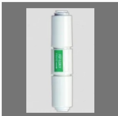
350,450,550,800 ml (K Flow) Flow Restrictor