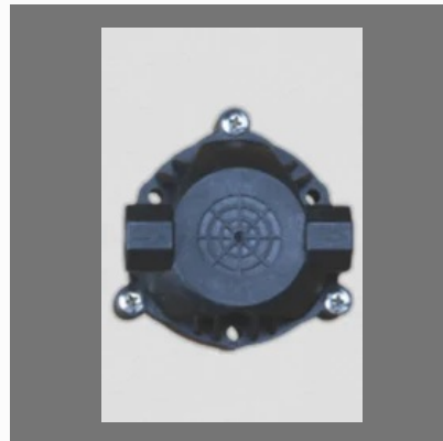
QX Pump Head