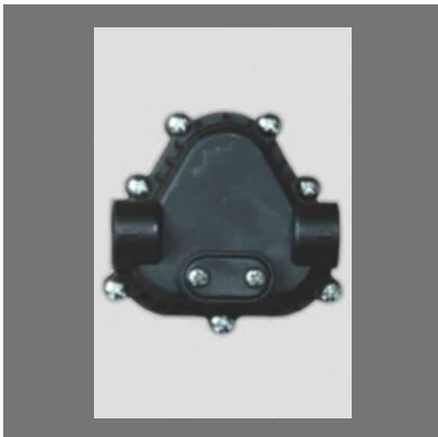
Plumber Pump Head