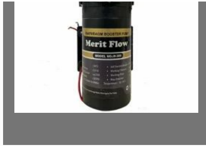
300 Gpd Ro Membrane