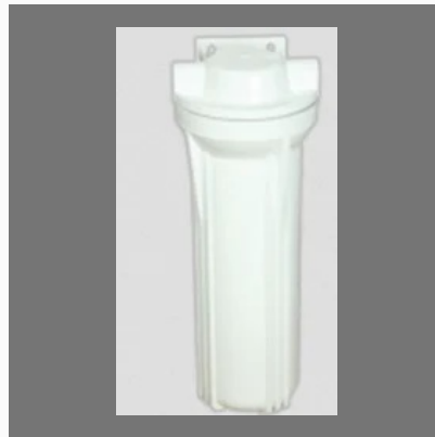
10 Inch Filter Housing With Bracket