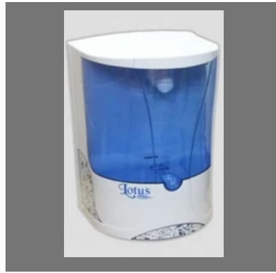
Lotus Dolphine RO