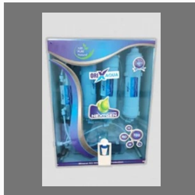
Nextgen UV Purifier