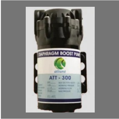
Diaphragm Boost Pump ATT 300