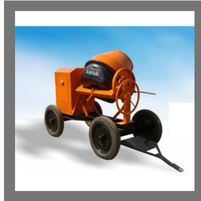
Hand Feed Concrete Mixer