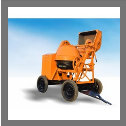
Hydraulic Concrete Mixer