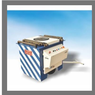
Bar Bending Machine 42