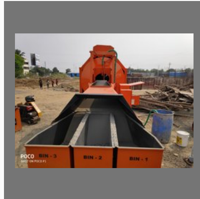
Concrete Mixer Machine