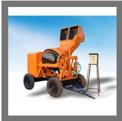
Concrete Mixer with Digital System