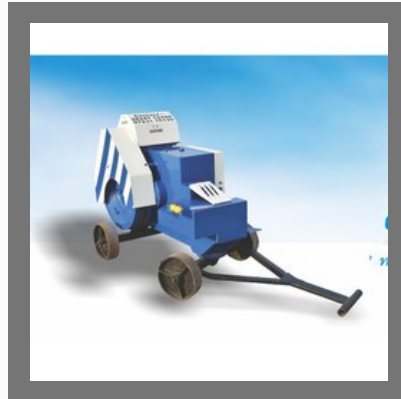
TMT Bar Cutting Machine