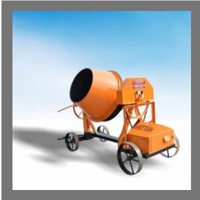
Mini Concrete Mixer