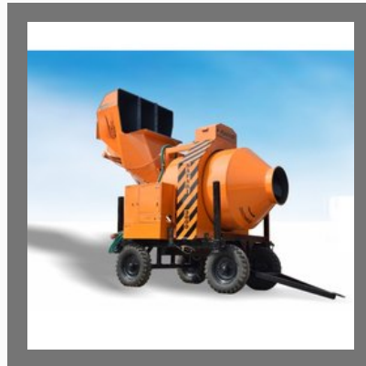
Reversible Drum Mixer