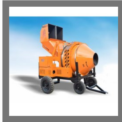
Reversible Drum Concrete Mixer