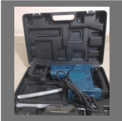
Concrete Breaker / Demolition Hammer