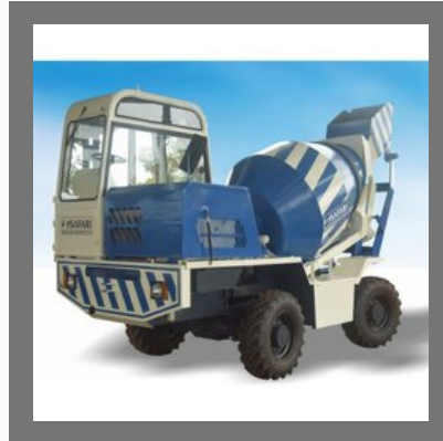
Self Loading Transit Concrete Mixer