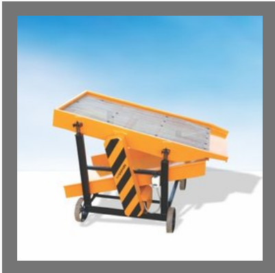
Sand Screening Machine