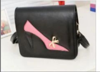
Designer Women Handbags Black