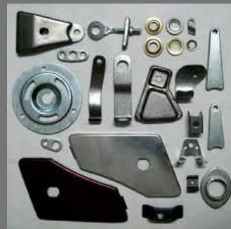
Sheet Metal Press Parts