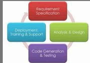
Product Design & Requirement Specification