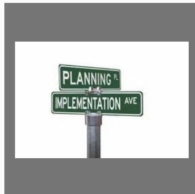
Better Planning And Implementation