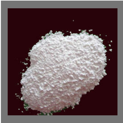
Sodium Acid Pyrophosphate (food Grade)