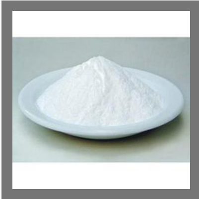
Mono Acid Calcium Phosphate ( Food Grade)