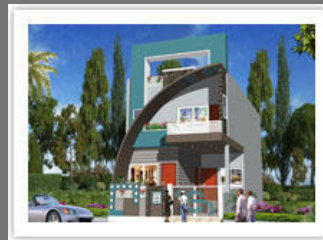
3 Bhk Super Duplex Plots