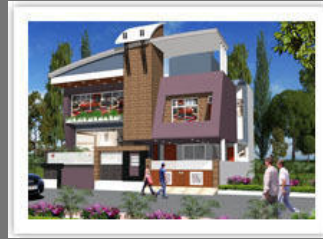
4 BHK Duplex