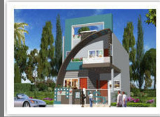
3 BHK Duplex