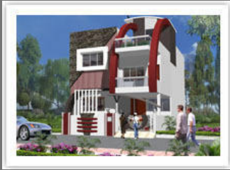
3 BHK Duplex