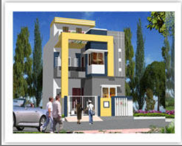
3 BHK Duplex