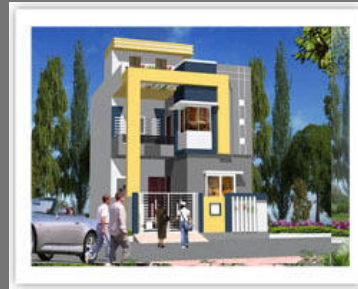
3 Bhk Duplex Plots