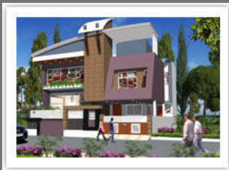
4 Bhk Duplex Plots