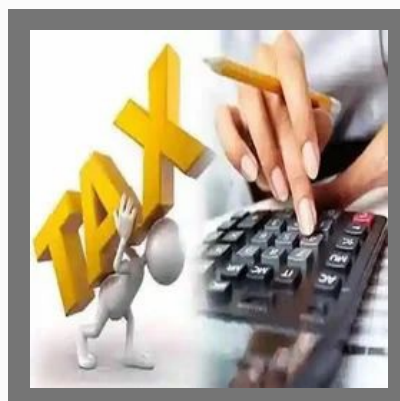
Tax Return Filing Agents