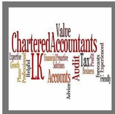
Chartered Accountant Services