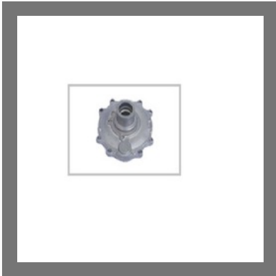
Compressor Part Manufacturing