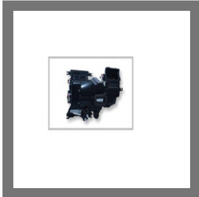
Automotive Air Conditioning