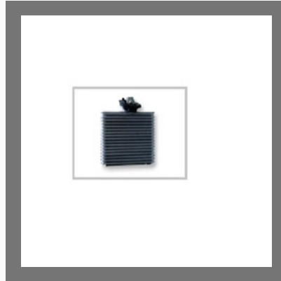
Metal Heat Exchangers Condenser Manufacturing