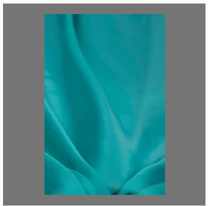
Plain Satin Fabric (RICH LOOK)