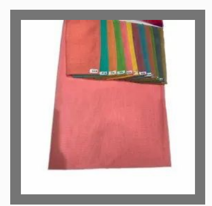
Plain Linen Fabrics