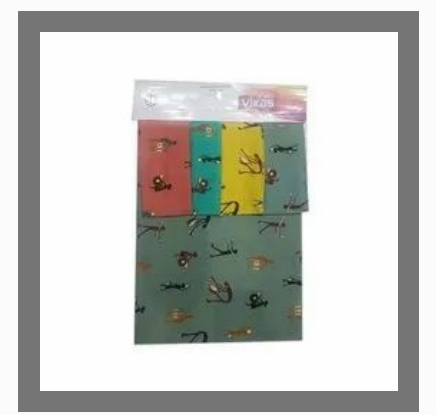
Printed Rayon Fabric