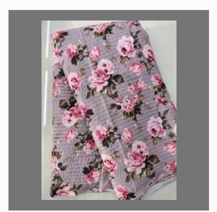
Grgt 100 Lining Seq. Digital