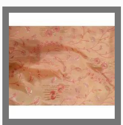
Floral Design Silk Embroidered