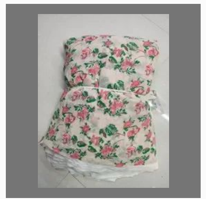
GRGT Digital Print