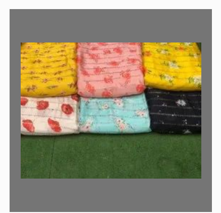
Satin Georgette Print Fabric