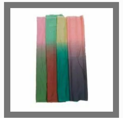
Shadow Polyester Fabric