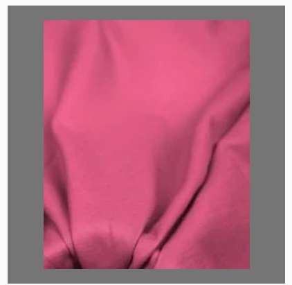
Plain Polyester Fabric