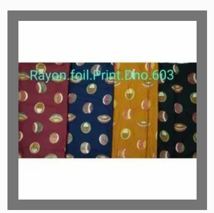
Foil Printed Rayon Fabric