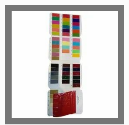
Rayon Plain Fabrics