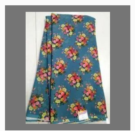
Grgt digital print