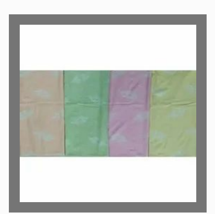
Printed Linen Fabrics