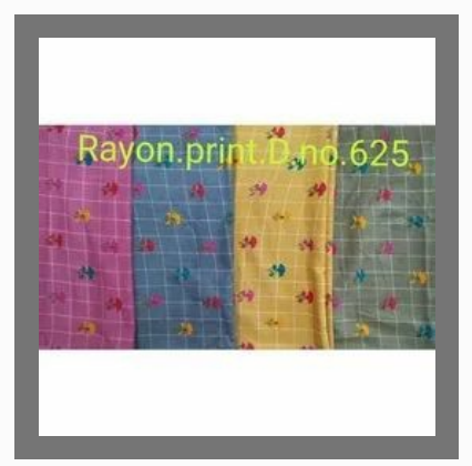
Flower Printed Rayon Fabric