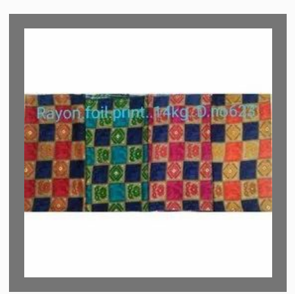
Square Printed Rayon Fabric