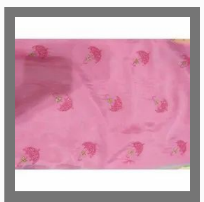
Umbrella Design Silk Embroidered