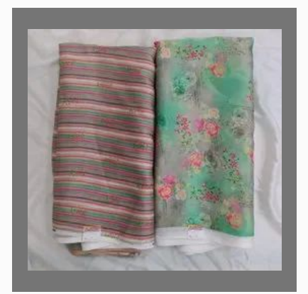
Satin Grgt Digital