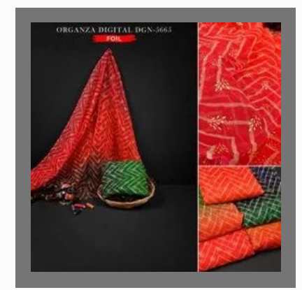
Organza Digital Print Foil