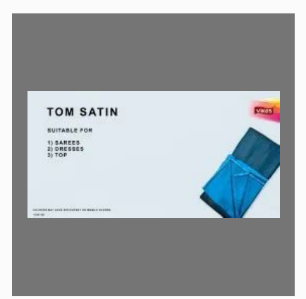
Plain Satin fabric