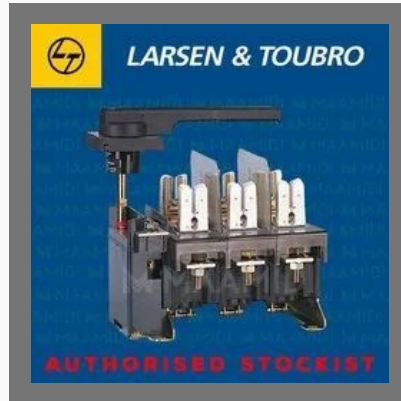
L&t Fn Main Switch