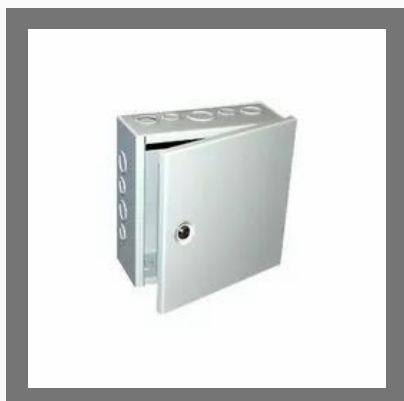
MS Junction Box