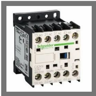
Schneider Control Relay