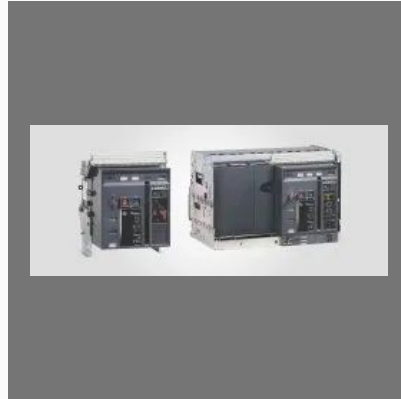
Air Cir Breaker