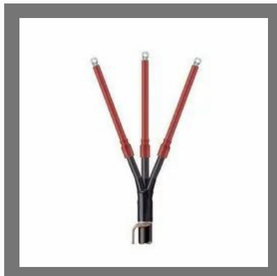
Raychem Jointing Kits