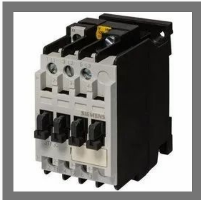
Siemens Power Contactor