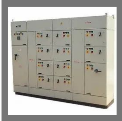
Electrical Control Panel