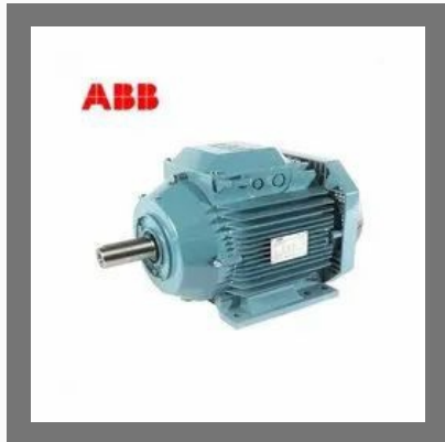
ABB Electric Motors