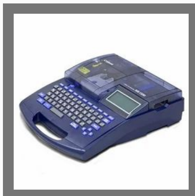
Canon Mk1500 Ferrule Printer