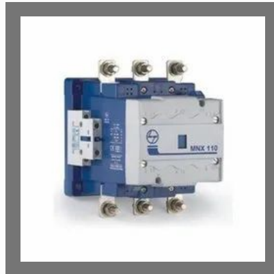
L & T MNX Contactor