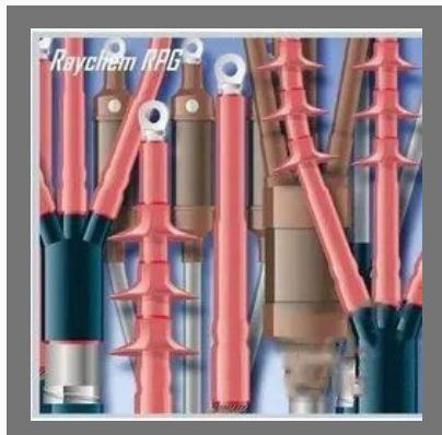
3m Make Cable Jointing Kit