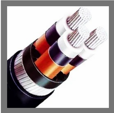
Polycab 3 Core XLPE HT Cables