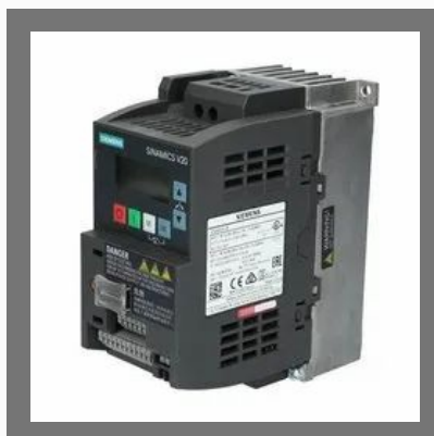
Siemens Vfd Ac Drive