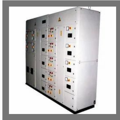
APFC Control Panel