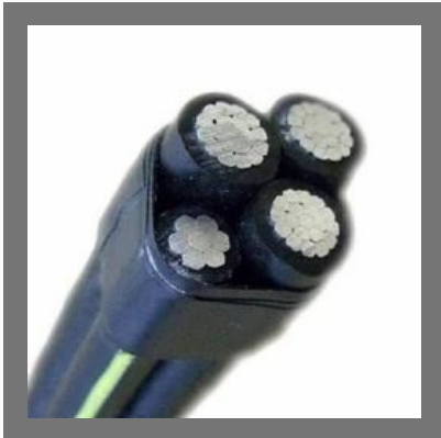
4 Core LT AB Aerial Bunched Cable