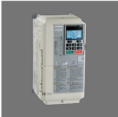
Yaskawa A1000 AC Drive