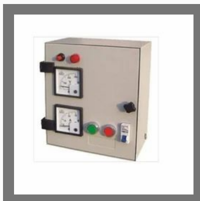
Submersible Pump Panel