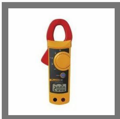
Fluke Clamp Meter