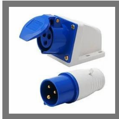
Industrial Electrical Plug Socket