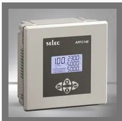
Selec APCF Relay