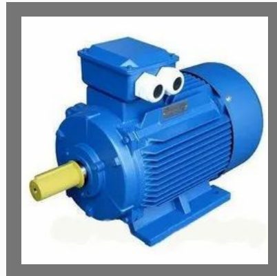
Kirloskar Electric Motor