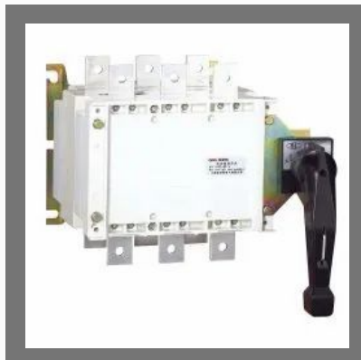
Socomec Changeover Switch