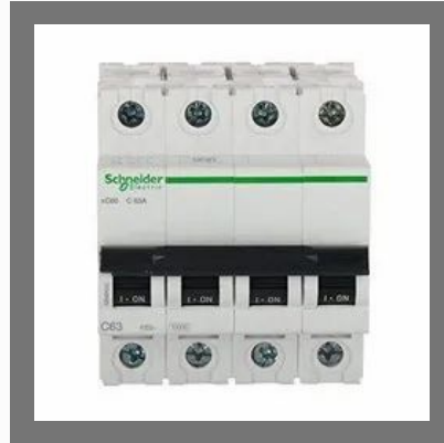
Schneider C60 Curve MCB