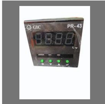
PID Temperature Controller