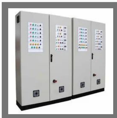
Three Phase Electrical Control Panel