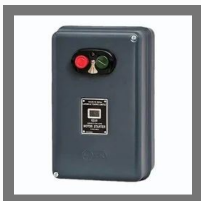
L&t Mk 1 Dol Starter