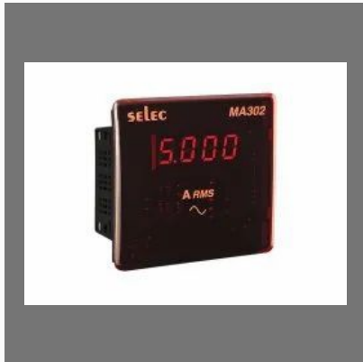
Selec Ampere Meter