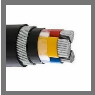
Polycab 3 Core Armoured Cable, 25 sq mm