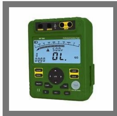
Rishabh Ait 501 Insulation Tester