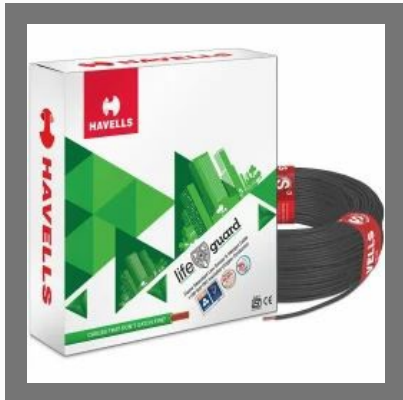
Havells House Wire