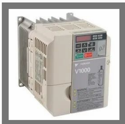
Yaskawa AC Drive