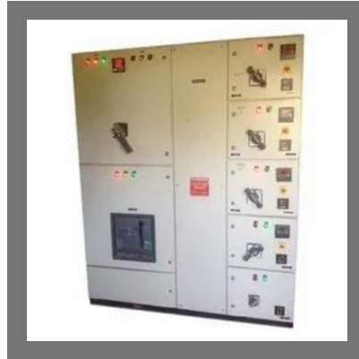
Control Panel Board