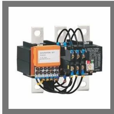
L&T MN2 Thermal Overload Relay