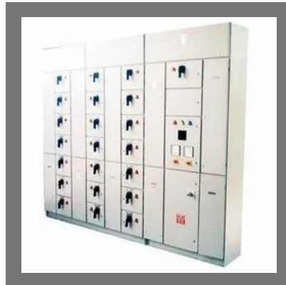
Distribution Panel Board