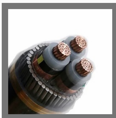
Havells 3 Core HT Copper Cables