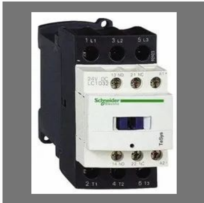
32 Amp Schneider Contactor