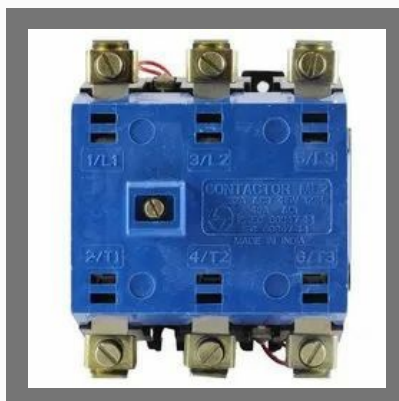
M L 4 Contactor