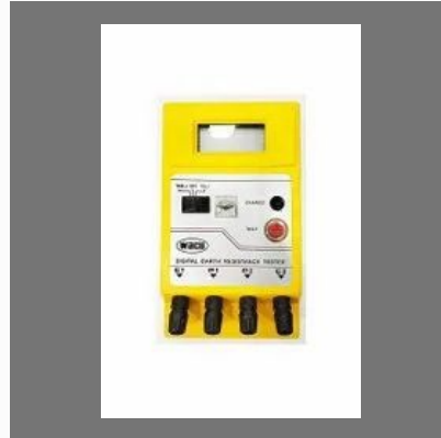
Waco Digital Earth Tester