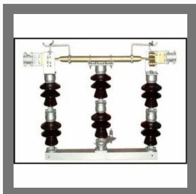
11 Kv Ab Switch