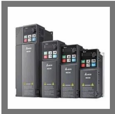
Delta VFD Ac Drive