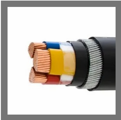
Polycab 3 Core Armoured Cable