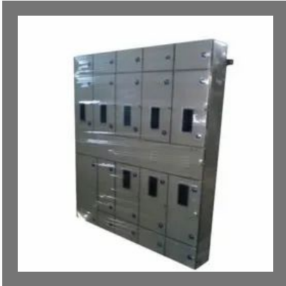
Meter Panel Board