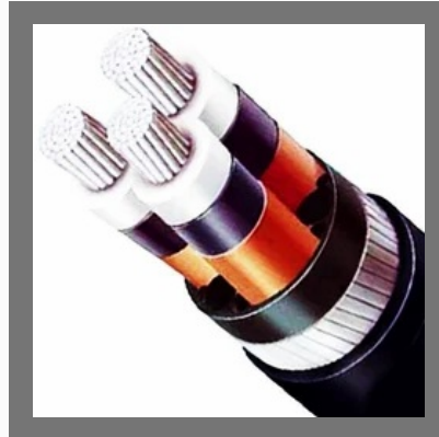
3 Core Xlpe Ht Cable