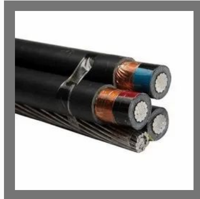
4 Core ABC HT Cable