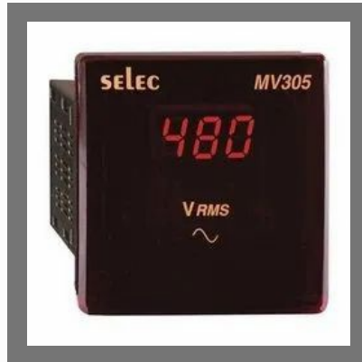
Selec Digital Voltmeter