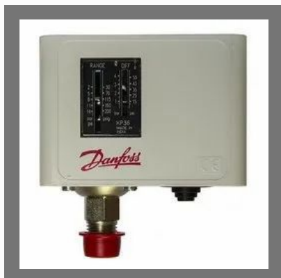
Danfoss Pressure Switch