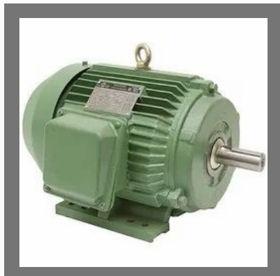
Crompton Greaves Motor