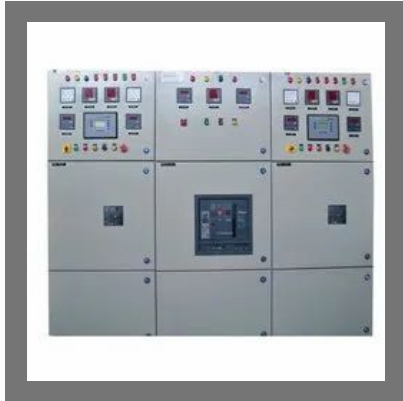
Dg Set Control Panel