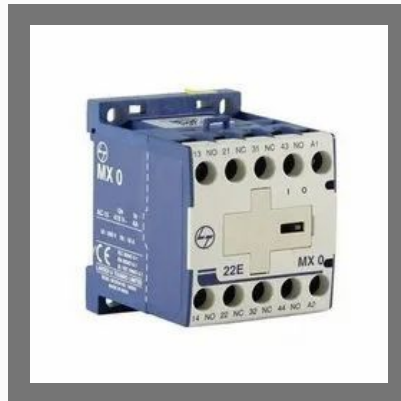
MX0 40E Control Relay