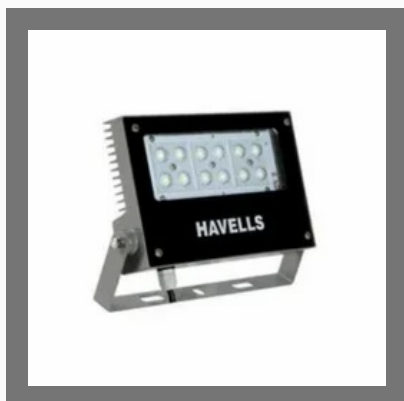
LED Flood Lights