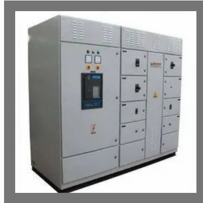
Power Distribution Panel