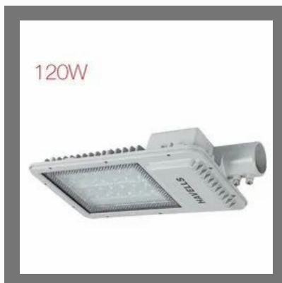
LED Street Light