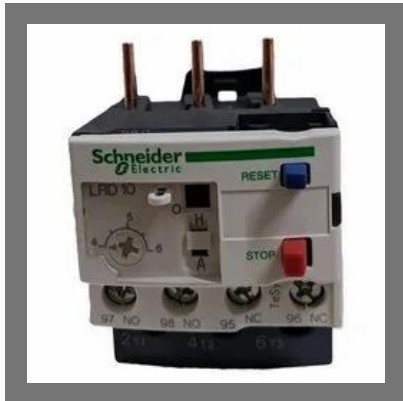
Schneider Make Overload Relay