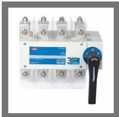
HPL Front Changeover Switch