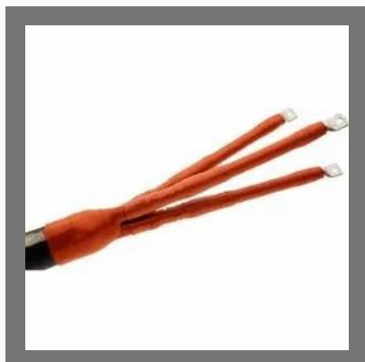
Heat Shrinkable Joints