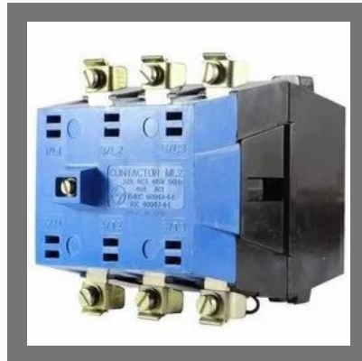
L T Power Contactors