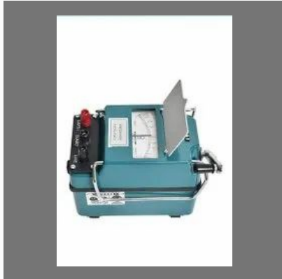
Waco Hand Driven Insulation Testers