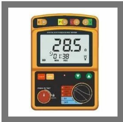
Digital Earth Tester