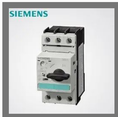
Siemens 3rv Mpcb