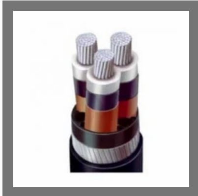
3 Core XLPE HT Cables