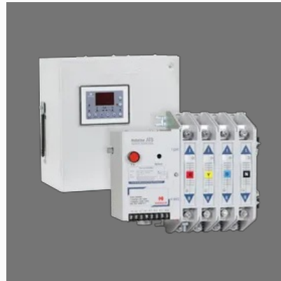
Havells Automatic Transfer Switch