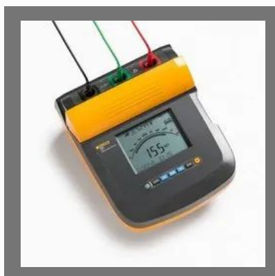
Fluke 1550C Insulation Tester