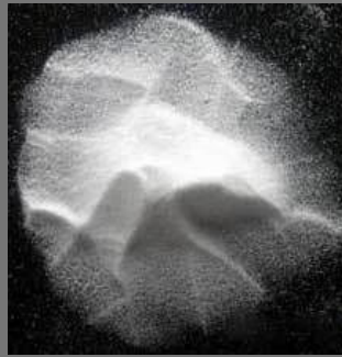
Silica Ramming Mass