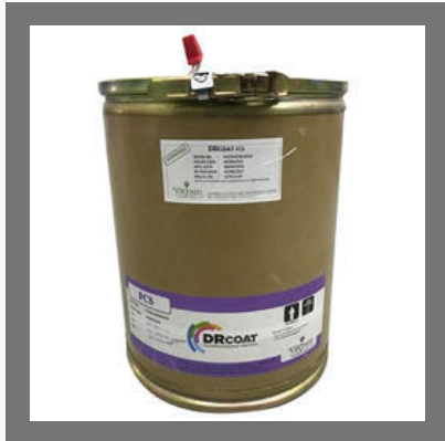
HPMC Based Film Coating