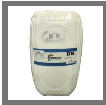
60 Kg Enteric Coating