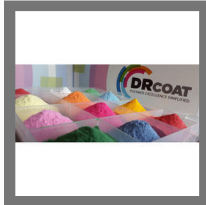
Aqueous Enteric Coating Powder