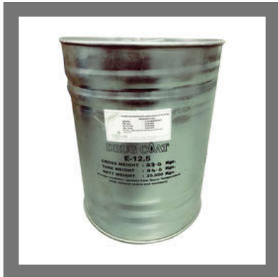
Amino Methacrylate Copolymer