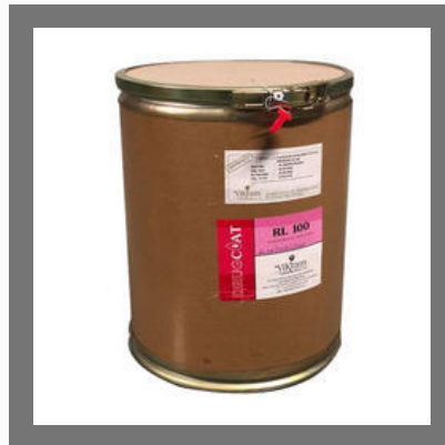
Ammonio Methacrylate Copolymer