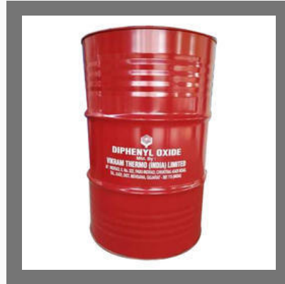
Concentrate Diphenyl Oxide