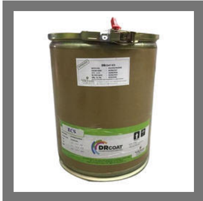
Methacrylic Acid Copolymer Based Enteric Coating