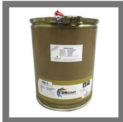
Aqueous Based Moisture Barrier