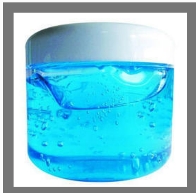
Liquid Aquapol Carbomer