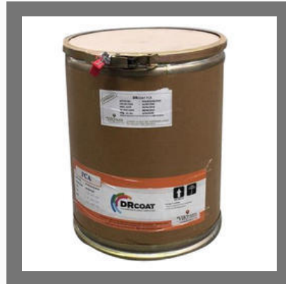
HPMC Based Film Coating