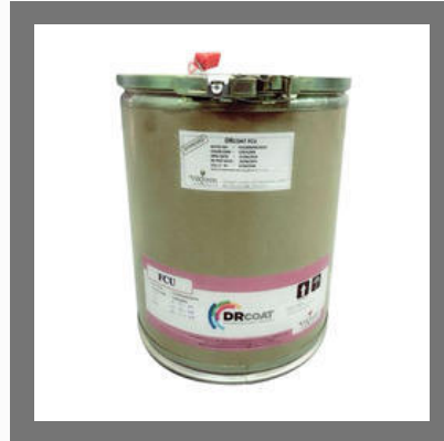
10 Kg Immediate Release Film Coating