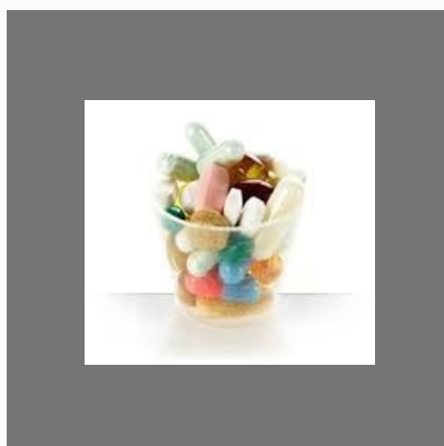
DRUGCOAT L100 55 Aqueous Enteric Coating