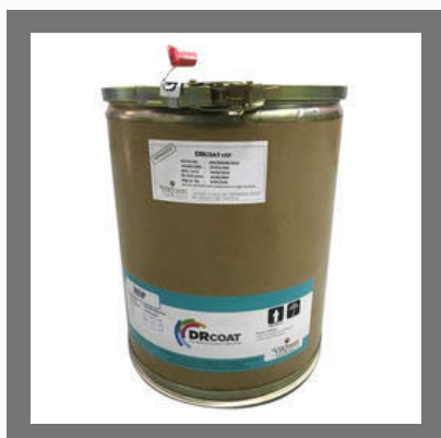
Drcoat Moisture Barrier