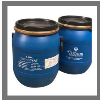
Amino Methacrylate Copolymer