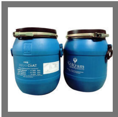
Amino Ethylacrylate Copolymer