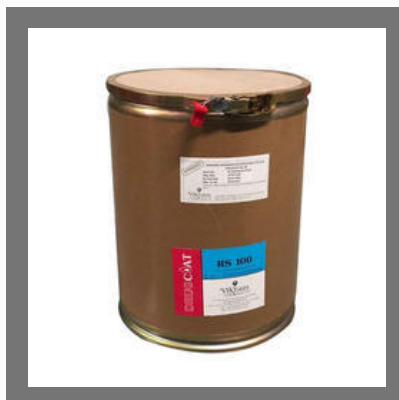
Ammonio Methacrylate Copolymer