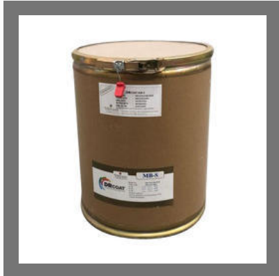
High Quality Moisture Barrier