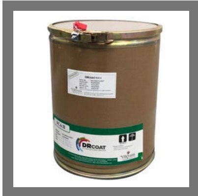
HPMC Based Film Coating