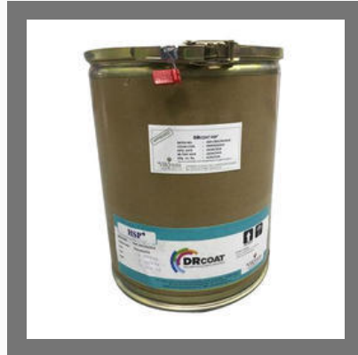
Solvent Moisture Barrier