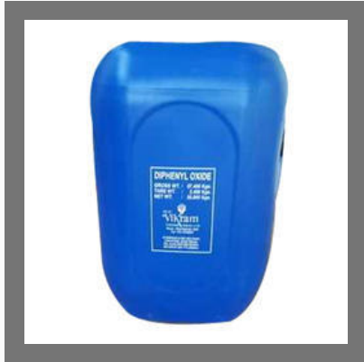
Liquid Diphenyl Oxide