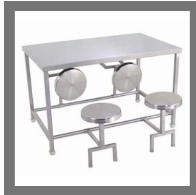
SS Dining Table