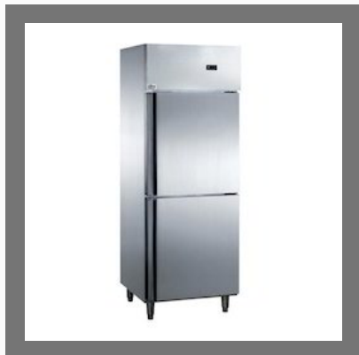
Two Door Vertical Refrigerator