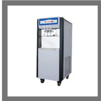
Softy Vending Machine