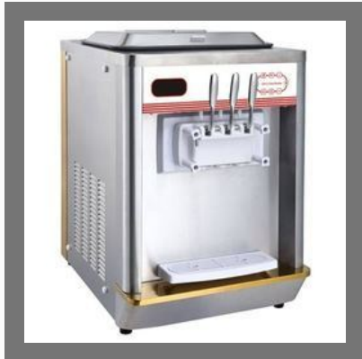
Softy Vending Machine