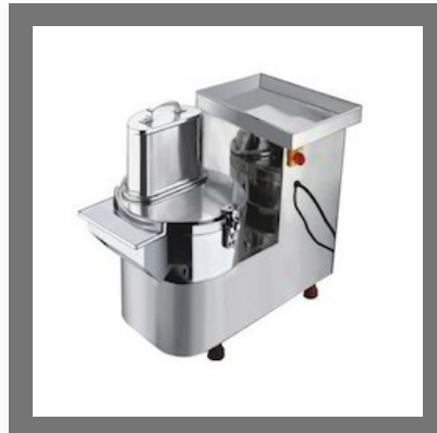
Vegetable Cutting Machine with 5 Blade