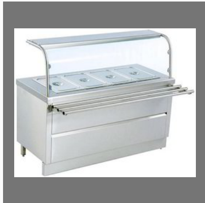
Bain Marie with Sneeze Guard and Tray Slide