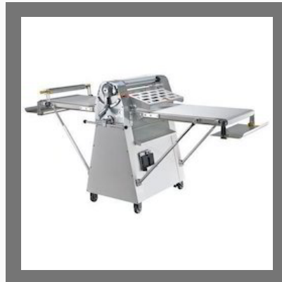
Dough Sheeter Floor Model