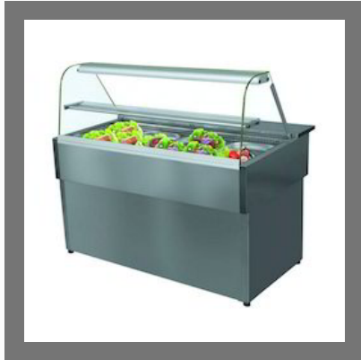
Cold Salad Counter