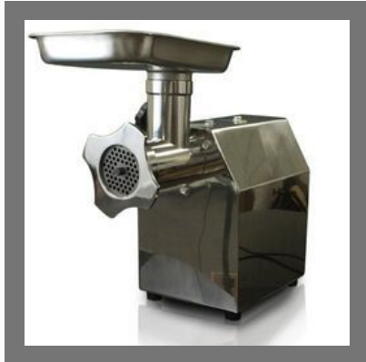
Electric Meat Mincer