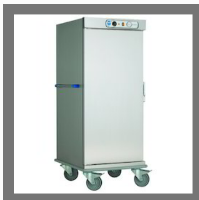
Food Transport Trolley