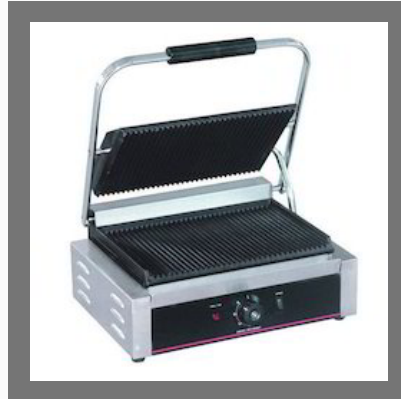
Jumbo Sandwich Griller