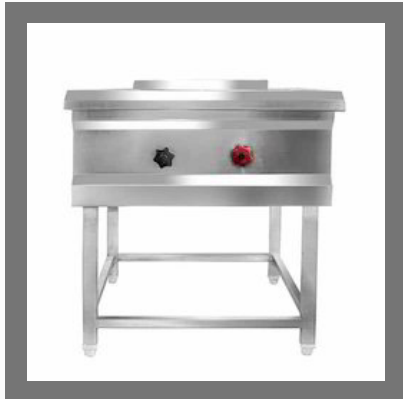
Single Stock Pot Stove