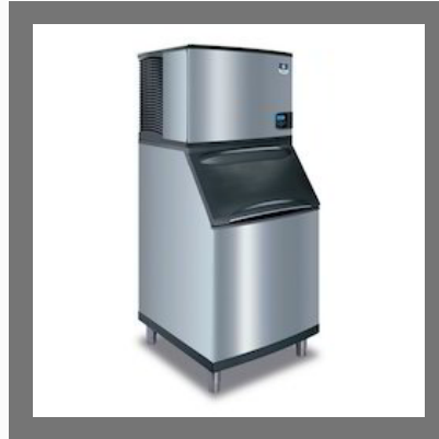
Ice Cube Machine