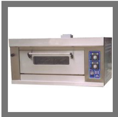
Single Deck Baking Oven