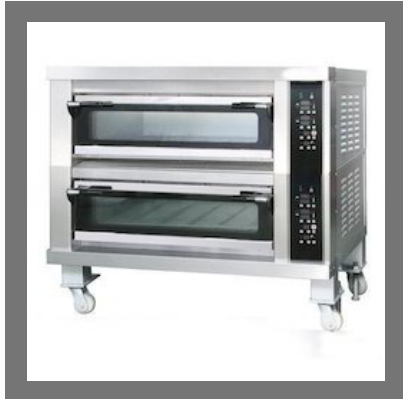
Double Deck Baking Oven