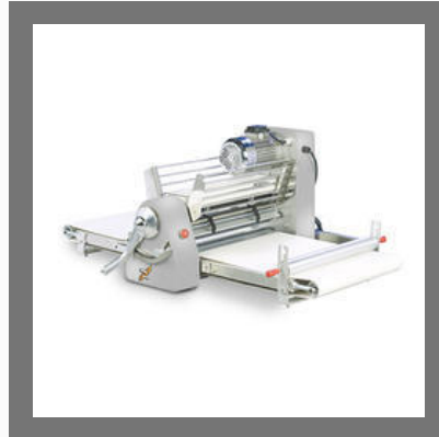
Table Top Dough Sheeter