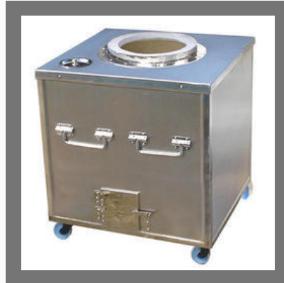
Tandoor Machine (Gas/Charcoal Operated)