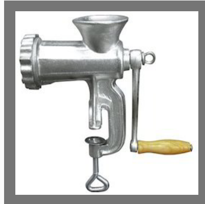
Manual Meat Mincer