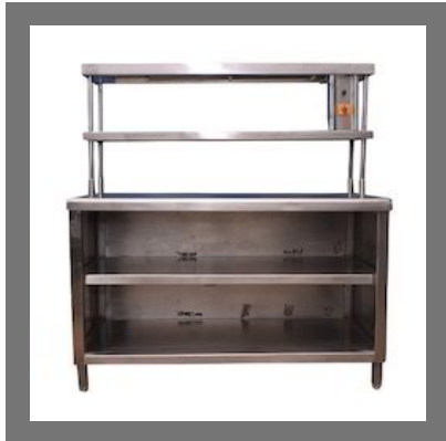
Two Overhead Shelf With Food Warmer