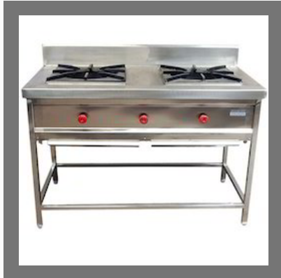
Indian Two Burner Range