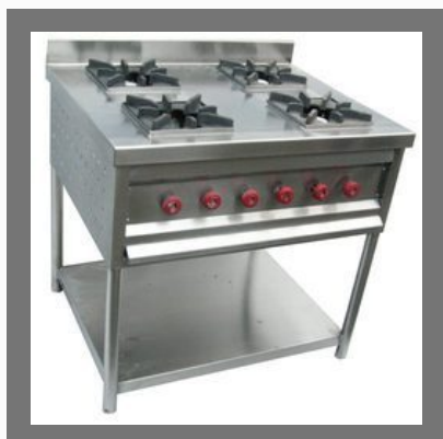
Four Burner Range