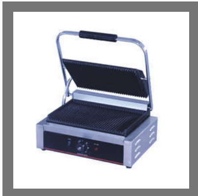
Single Sandwich Griller