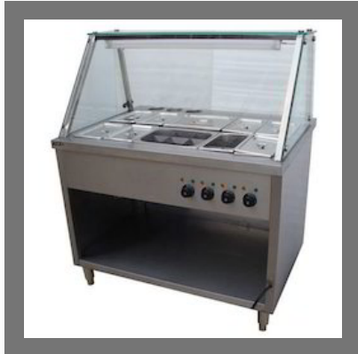
Bhalle Papdi Counter (Normal)