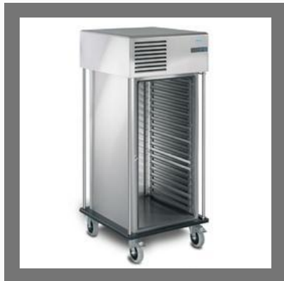
Food Transport Trolley