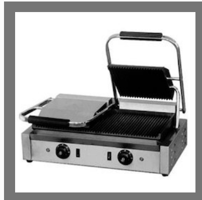
Double Sandwich Griller