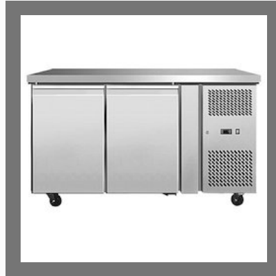
Two Door U/C Refrigerator