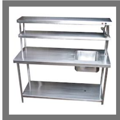
Work Table with Two Under and OHS