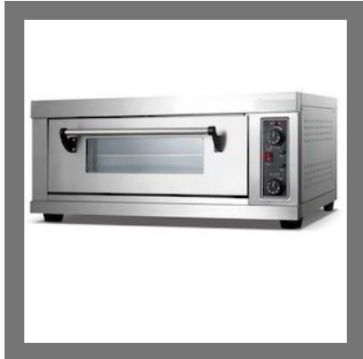
Pizza Oven with Stone Base