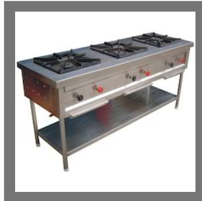
Three Burner Range