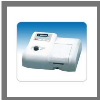
LT-29 Microprocessor UV-VIS Spectrophotometer