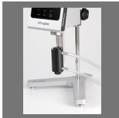
Fungilab Small Sample Adaptor