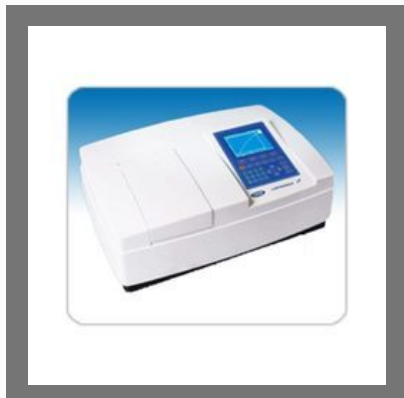
Double Beam UV-Visible Spectrophotometer