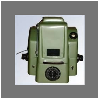
Infrared Moisture Balance