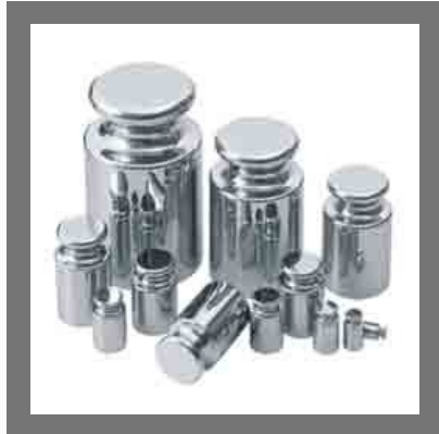
Standard Calibration Weight