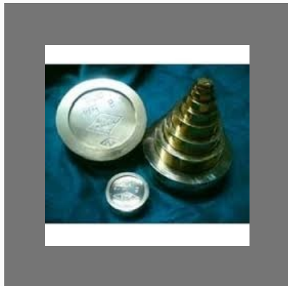
Brass Bullion Weight