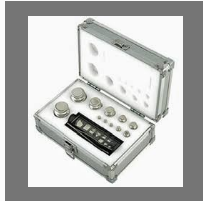
Standard Calibration Weights Sets