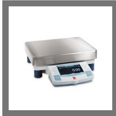
High Precision Balance