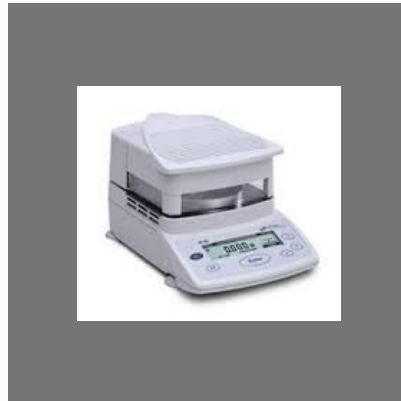
Infrared Moisture Balance