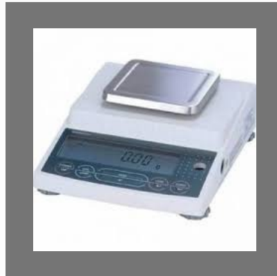
High Precision Balance