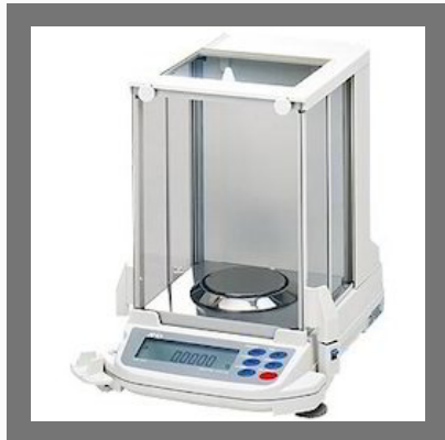
Semi Micro Analytical Balance