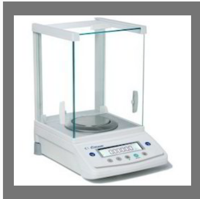
Semi Micro Balance