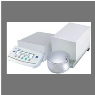
Filter Micro Balance