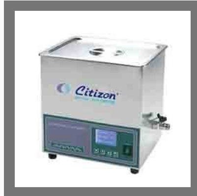
Ultrasonic Cleaning Tank