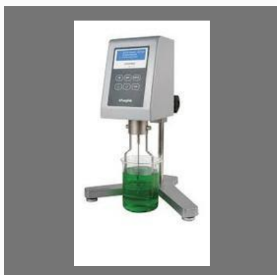
Original Fungilab Viscometer