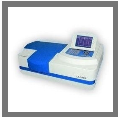
Double Beam Spectrophotometer