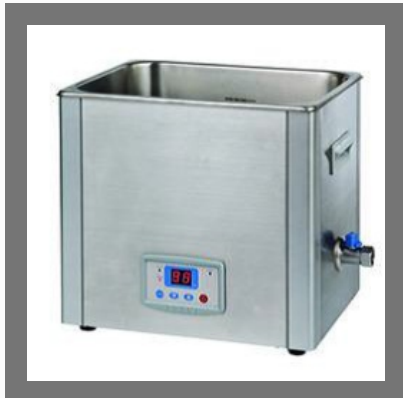
Table Top Ultrasonic Cleaner