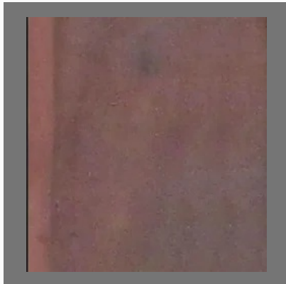
FL0005 Finished Leather