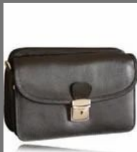
OB0003 Office Bags