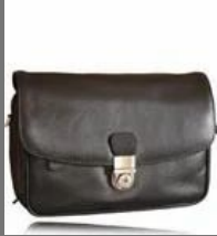
OB0005 Office Bags