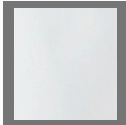
FL0004 Finished Leather