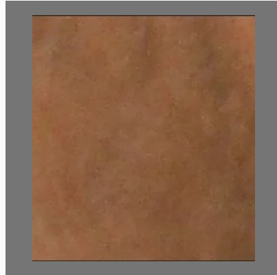
FL0002 Finished Leather