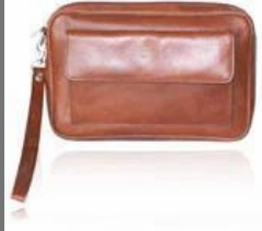
OB0001 Office Bags