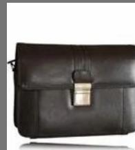
OB0004 Office Bags