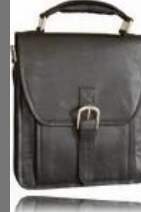
OB0002 Office Bags