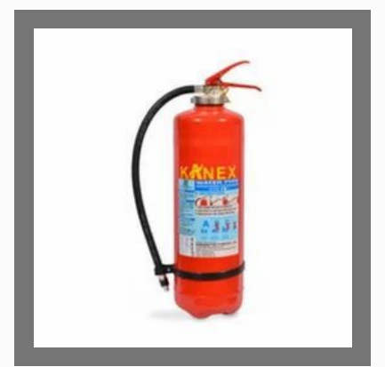
Carbon Dioxide Fire Extinguisher