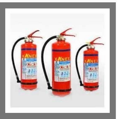
ABC Stored Pressure Type Fire Extinguisher