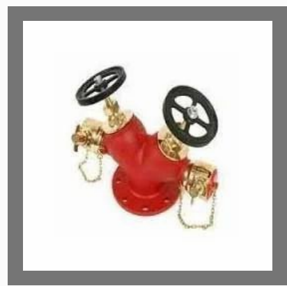
Double Headed Fire Hydrant