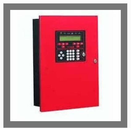
Fire Control Panel