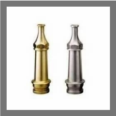
Fire Hydrant Nozzle