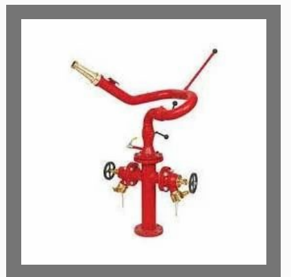
Fire Hydrant Stand Post