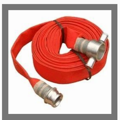
Fire Hydrant Hose