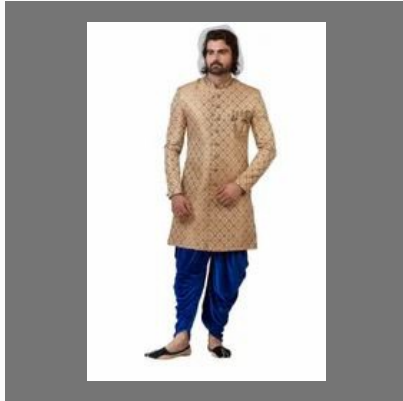
Indo Western For Men