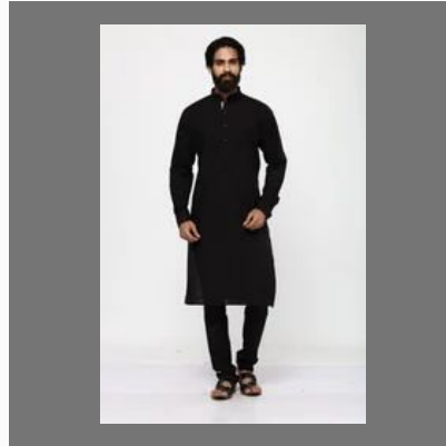
Fancy Long Kurta For Men