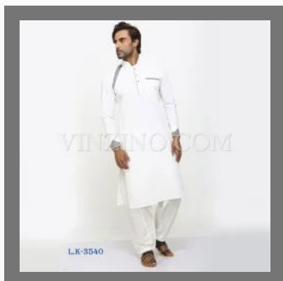
Ethnic Wear Men Kurta