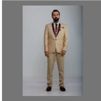
Stylish Men's Suit