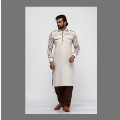
Long Kurta For Men