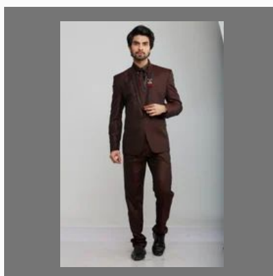
Dark Brown Men's Suit