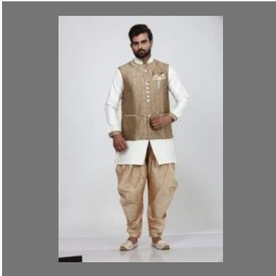
Rajniti With Coti For Men