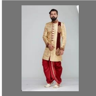
Indo Western Dress