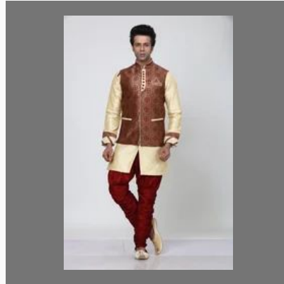
Men's Designer Rajniti With Coti