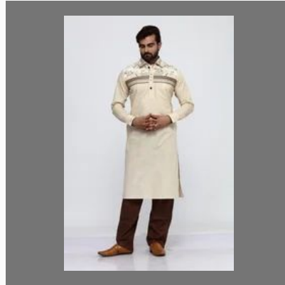
Stylish Men Kurta