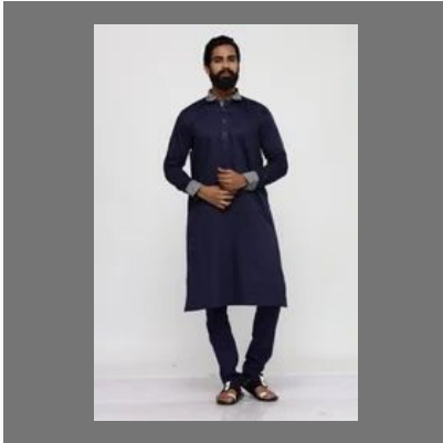
Fancy Mens Kurta