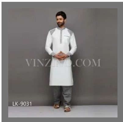
Long Kurta For Men