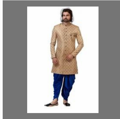
Mens Wedding Dress