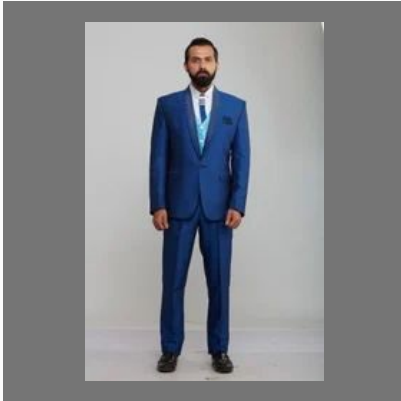
Men's Wedding Dress