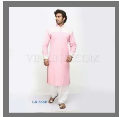
Fancy Mens Kurta