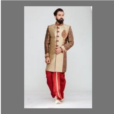
Men's Wedding Dress