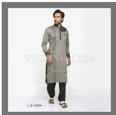
Long Kurta For Men