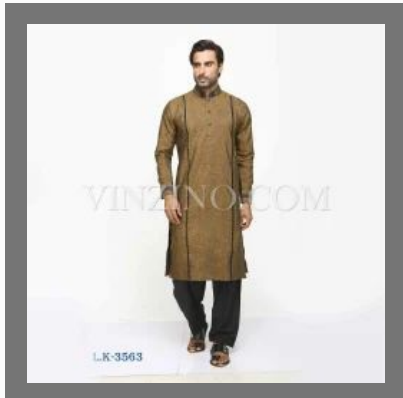
Designer Mens Kurta