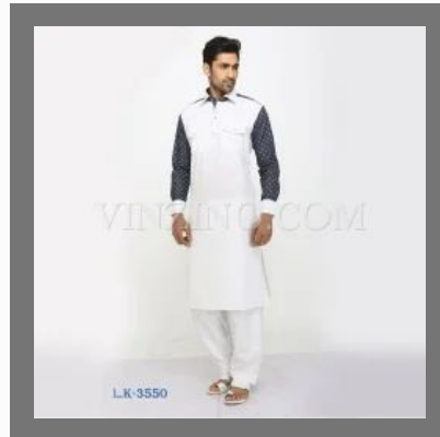
Men's Designer Long Kurta