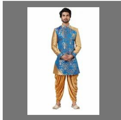
Mens Stylish Wedding Dress