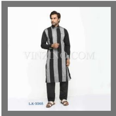
Stylish Long Kurta For Men