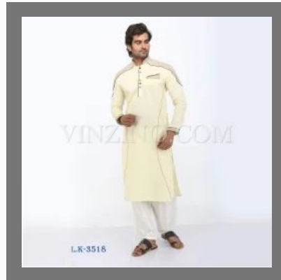
Designer Long Kurta For Men