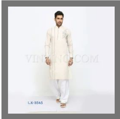
Long Kurta For Men