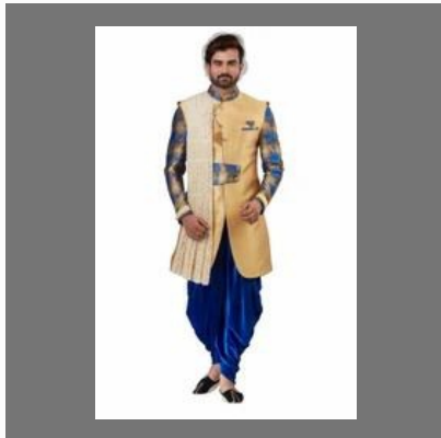
Fancy Wedding Suit