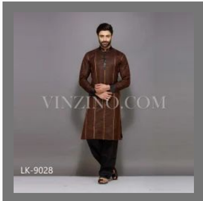
Designer Long Kurta For Men