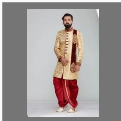
Stylish Party Wear Dress