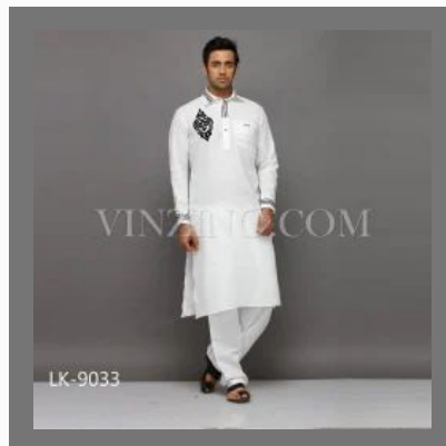
Designer Mens Kurta