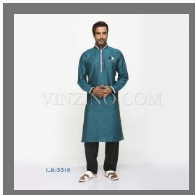
Fancy Long Kurta For Men