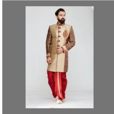
Men's Wedding Dress