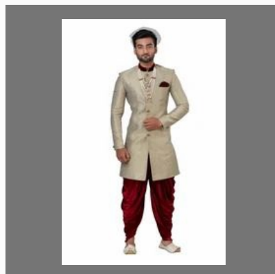
Men's party Wear Dress