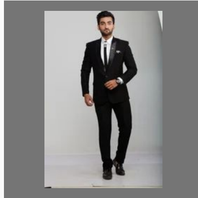
Fancy Men's Suit