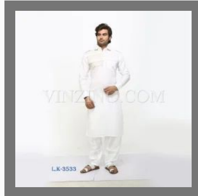
Stylish Men Kurta