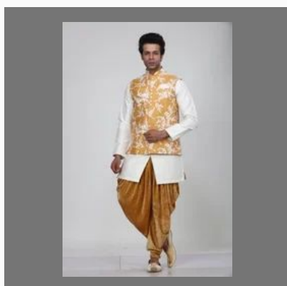
Stylish Men Rajniti With Coti