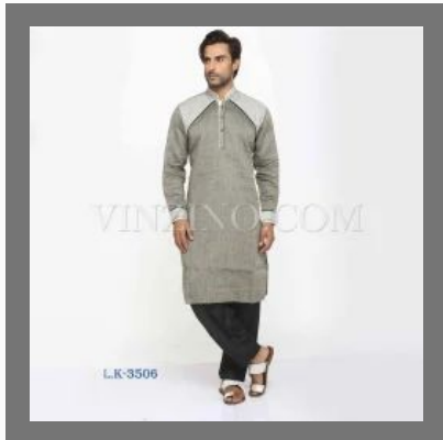
Long Kurta For Men