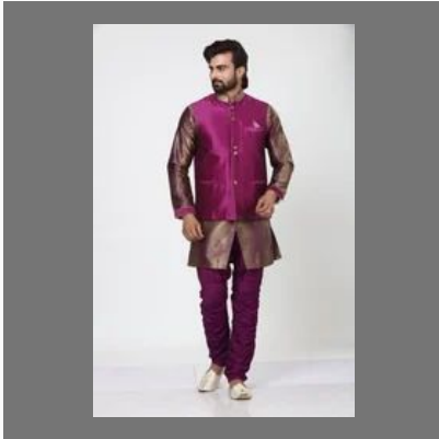
Men's Rajniti With Coti