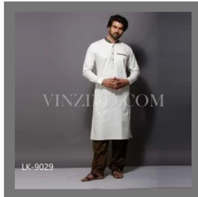
Long Kurta For Men