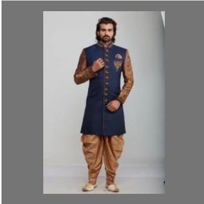
Indo Western For Men's