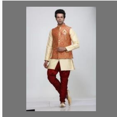
Mens Stylish Rajniti With Coti