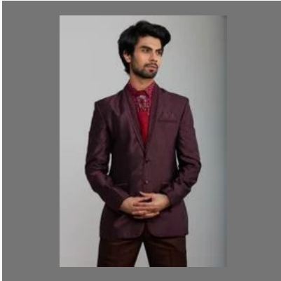
Designer Men Suit