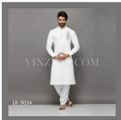
Fancy Mens Kurta