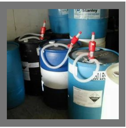
Water Treatment Chemicals