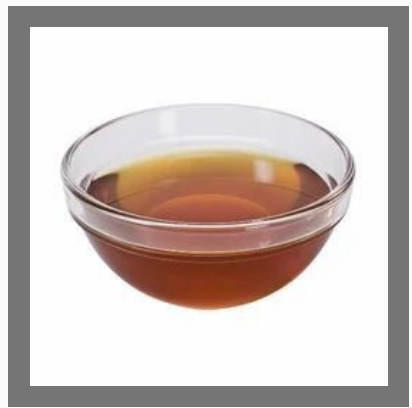
Sugar Processing Chemicals