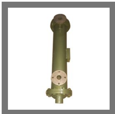
Lube Oil Cooler