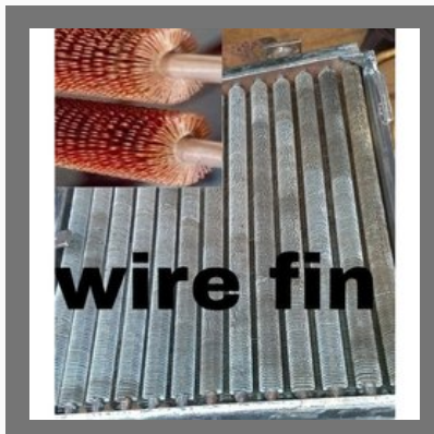
Oil Cooler Crimped Wire Fin Tube