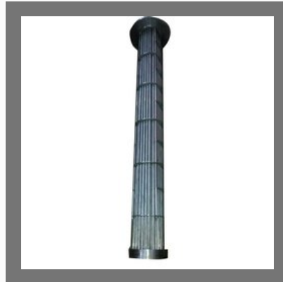
Stainless Steel tubes bundle