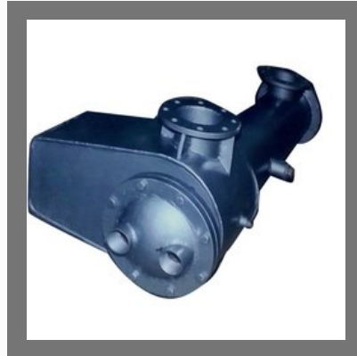
Oil Heat Exchangers