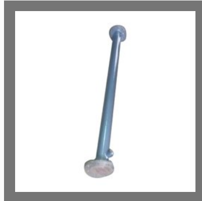
Water Cooled Aftercoolers for kirloskar air compressor