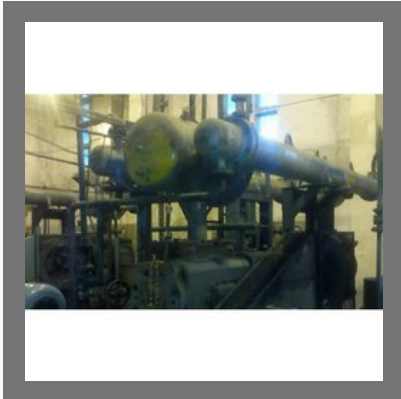
Industrial Heat Exchanger