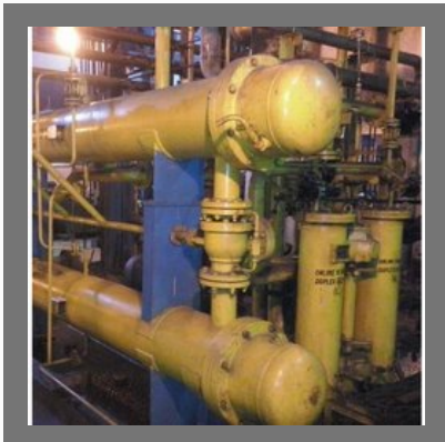
Duplex Oil Cooler Heat Exchanger