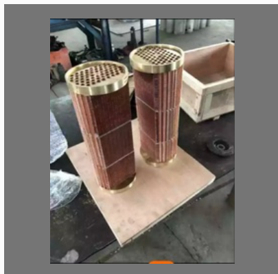
Copper Air Compressor After Cooler