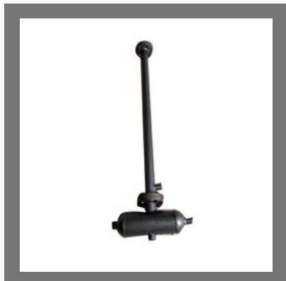
40 cfm Copper Air Compressor Aftercoolers