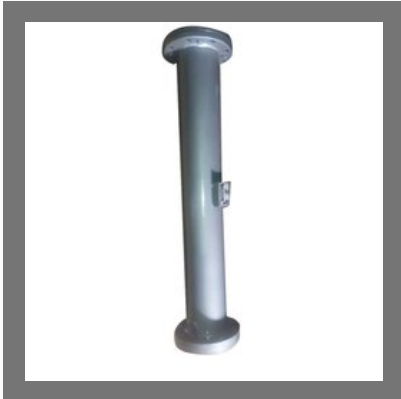
Water Cooled Aftercooler for kg khosla compressor