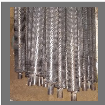
Spiral Fin Tubes