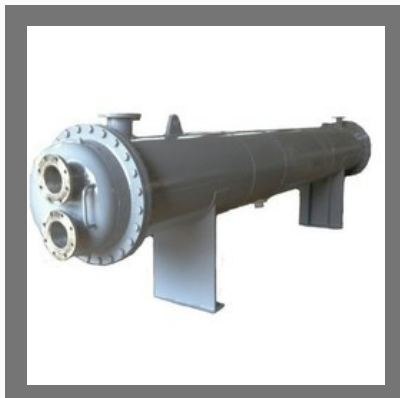
Shell and tubes heat exchanger