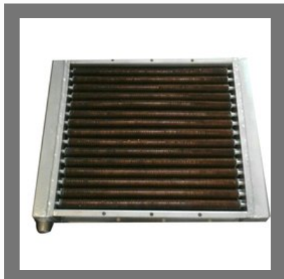
Fintubes Radiators / oil cooler heat exchanger