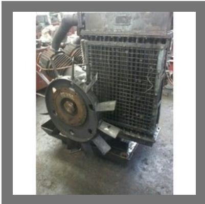
Fin Type Air After Cooler