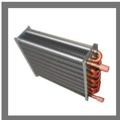
Fin Type Oil Cooler Radiator