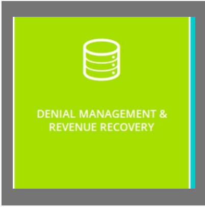
Denial Management Service