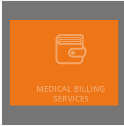
Medical Billing Service