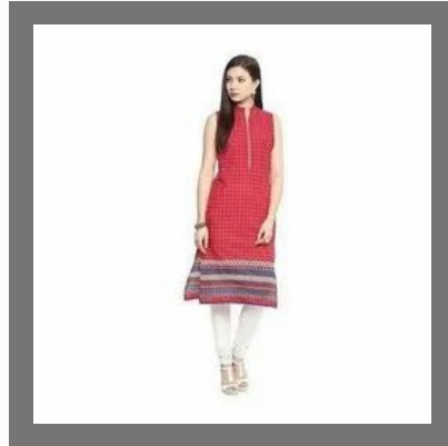
Sleeveless Cotton Kurtis