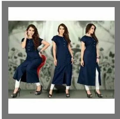
Ladies Plain Kurti