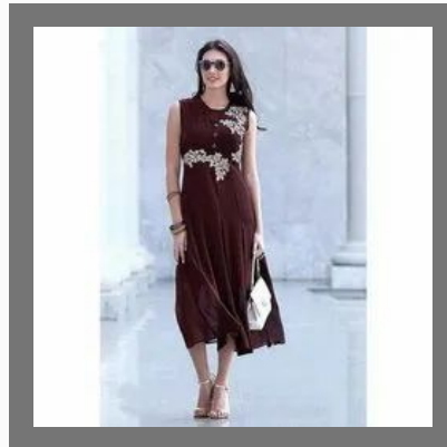
Ladies Designer Sleeveless Kurti