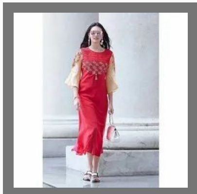
Ladies Long Kurti