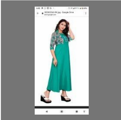
Designer embroider ryon kurti