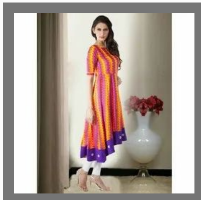
Stylish Cotton Kurtis