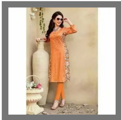
Ladies Designer Casual Kurti