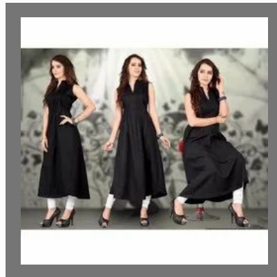
Ladies Black Kurti