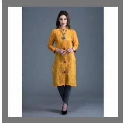
Yellow Cotton Kurtis