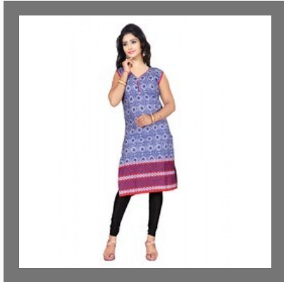
Ladies V Neck Cotton Kurtis