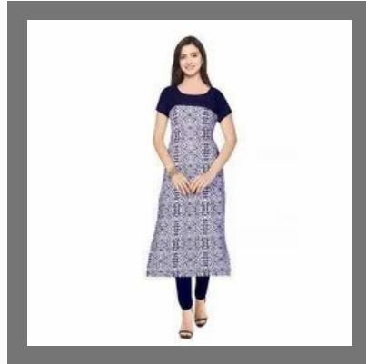
Fancy Cotton Kurtis