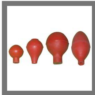
Laboratory Rubber Bulb