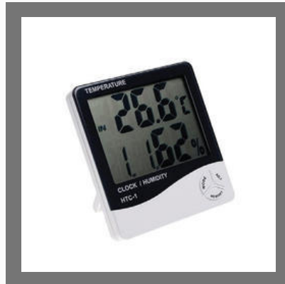
Digital Thermo Hygrometer