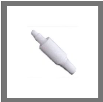
Teflon Mercury Seal