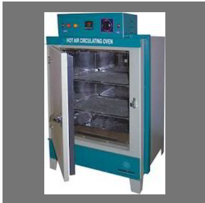
Laboratory Hot Air Oven