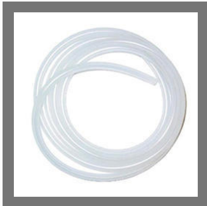
Silicon Tubing Top Rubber