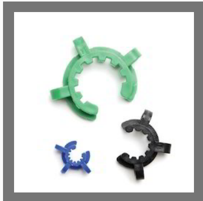
Joint Clips Plastic