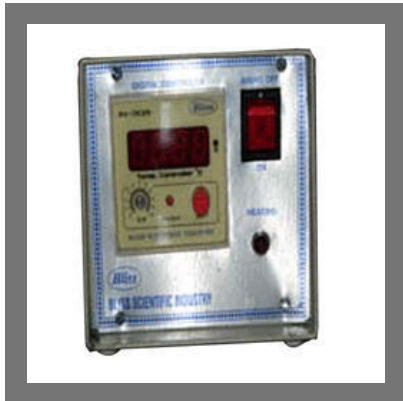
Digital Temperature Controller