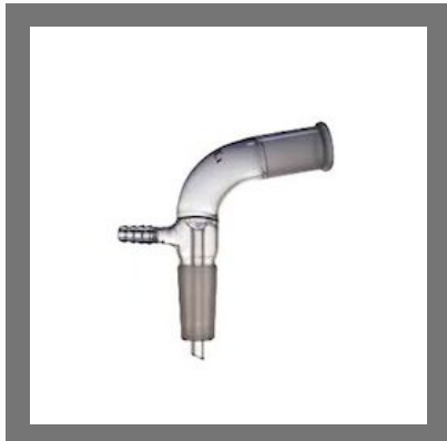
Adapter Receiving Plain Bend