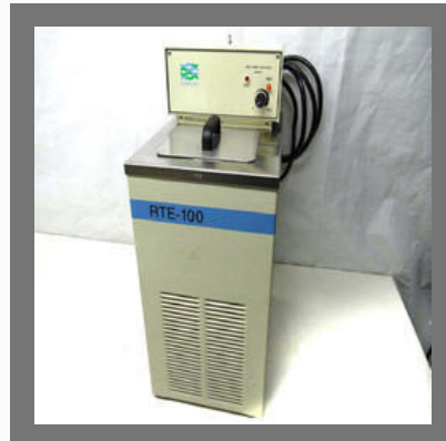
Chiller Bath (Single Compressor)