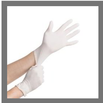
Powder Free Gloves