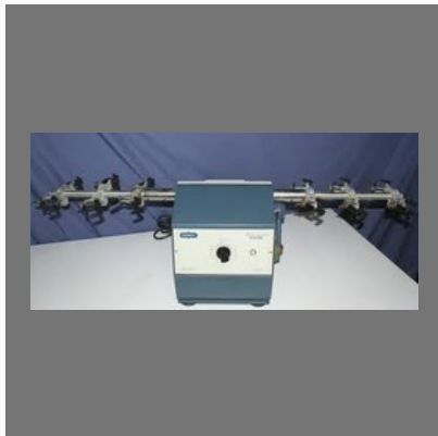
Wrist Action Shaker