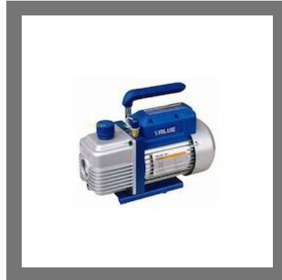
Vacuum Pump (Imported)