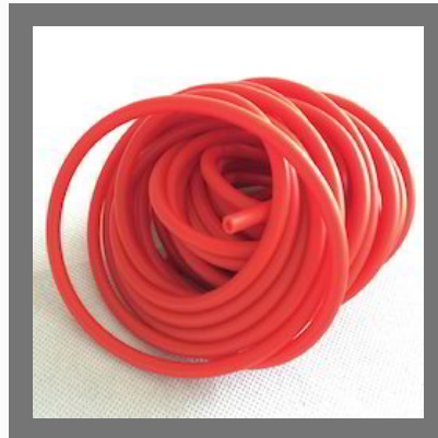
Pressure Rubber Tubing