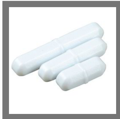
Magnetic Beads (Cylindrical)