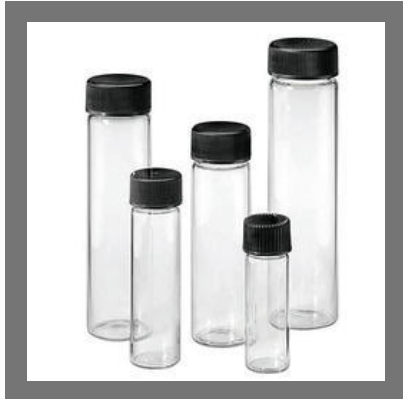
Glass Vial / Culture Tube