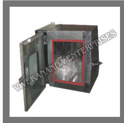
Vacuum Oven Rectangular