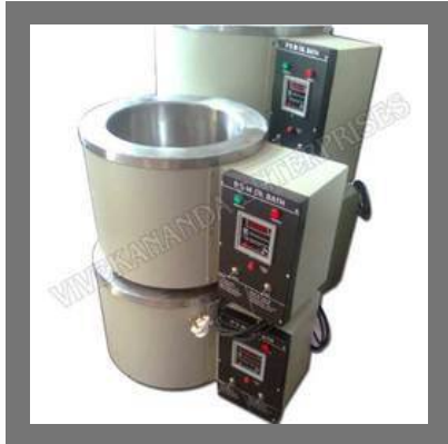
Laboratory Oil Bath Double Walled Digital