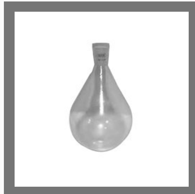
Buchi Receiving Flask