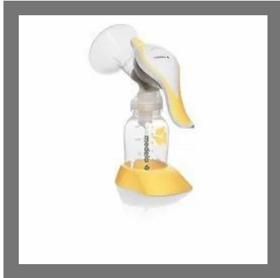
Harmony Breast Pump