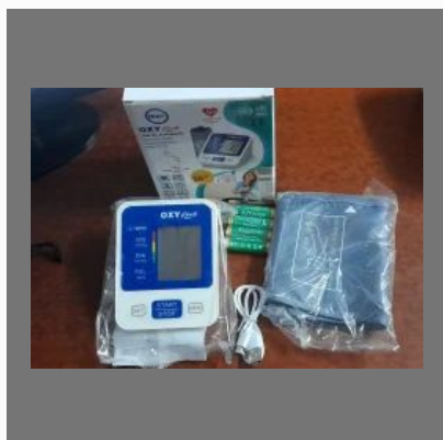
Digital Bp Monitor