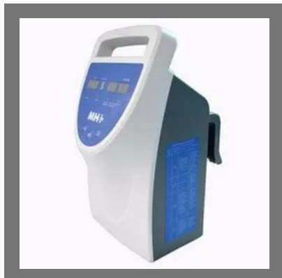
DVT Prevention Pump