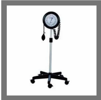
Stand Type BP Sphygmomanometer