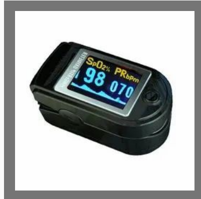
Fingertip Pulse Oximeter