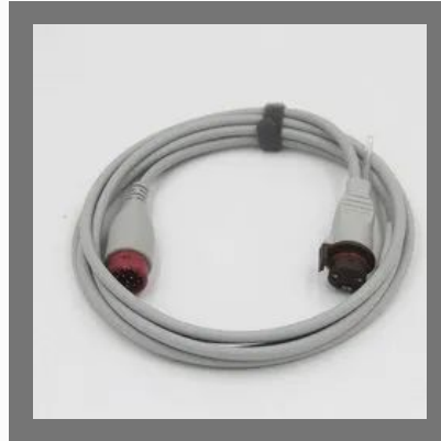
Transducer IBP Cable