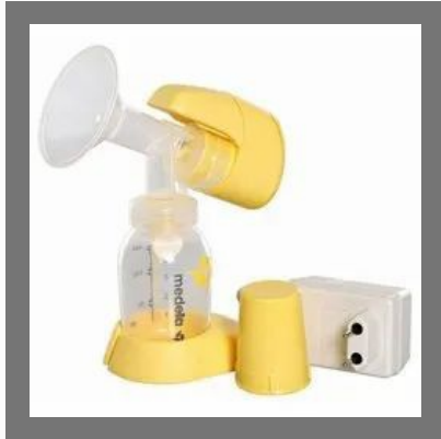
Mini Electric Breast Pump