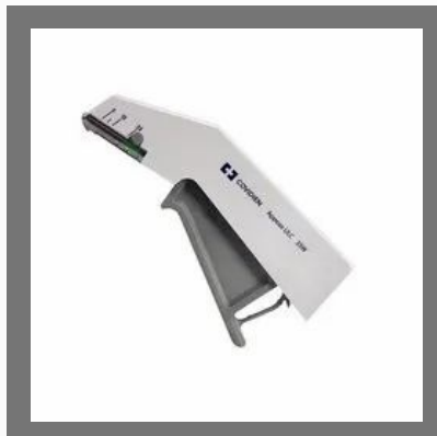
Skin Stapler 35w