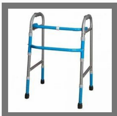
Adjustable Folding Walker