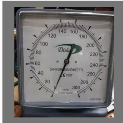
Clock Type Sphygmomanometer