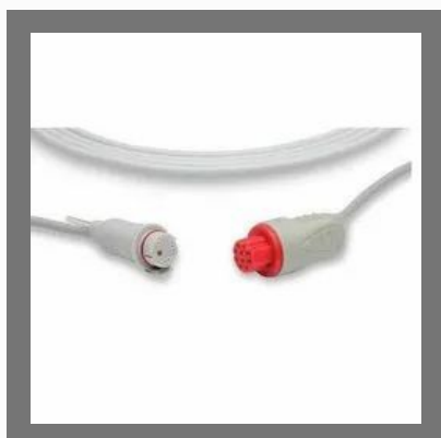
IBP Cable Connector