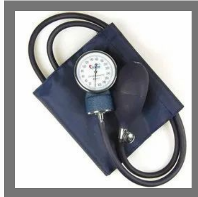
Mercury BP Apparatus