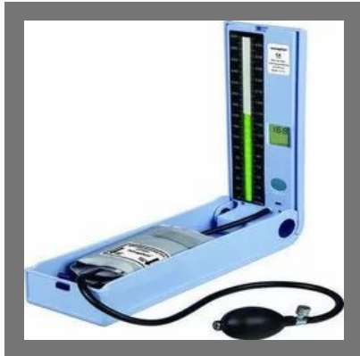
LED BP Apparatus