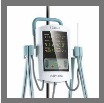
Blood Infusion Warmer