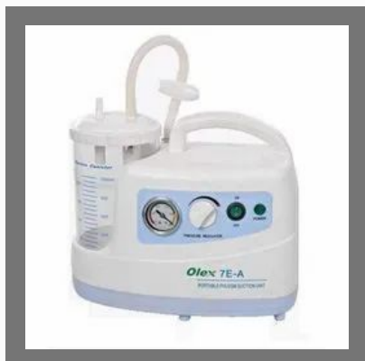
Olex Portable Suction Machine