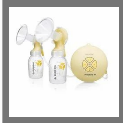
Swing Breast Pump