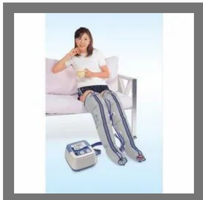
Compressible Limb Therapy System