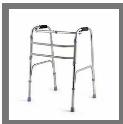
Aluminium Folding Walker