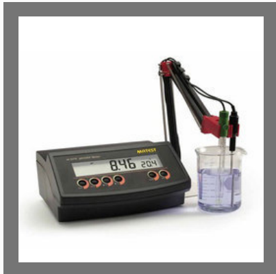
Digital pH Meter