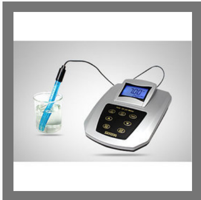
Digital Conductivity Meter