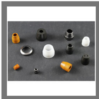
GC Graphite Ferrules