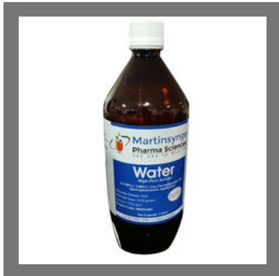
HPLC Grade Water